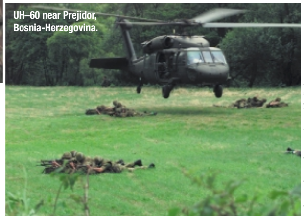
UH-60 near Prejidor, Bosnia-Herzegovina.