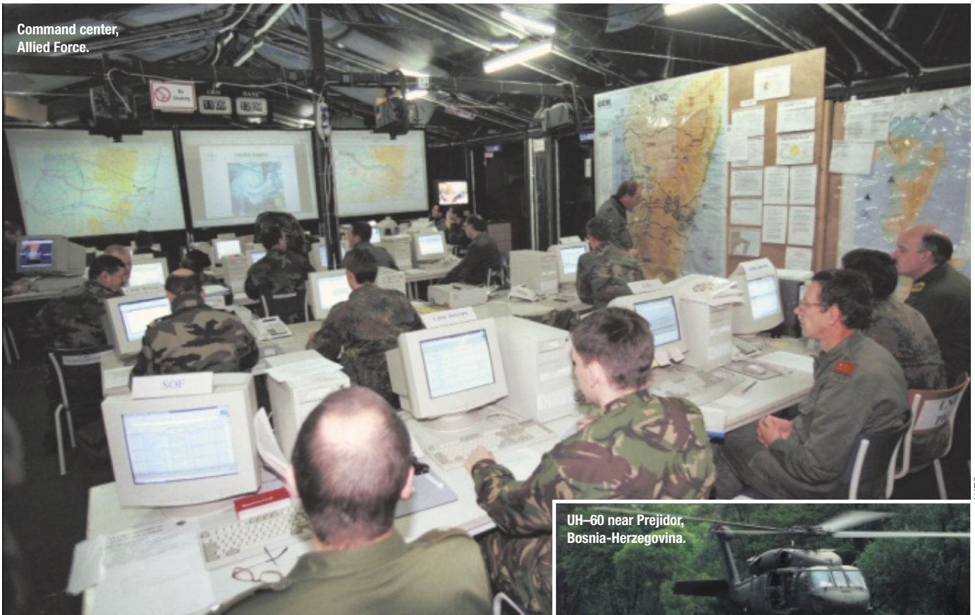
Command center, Allied Force.