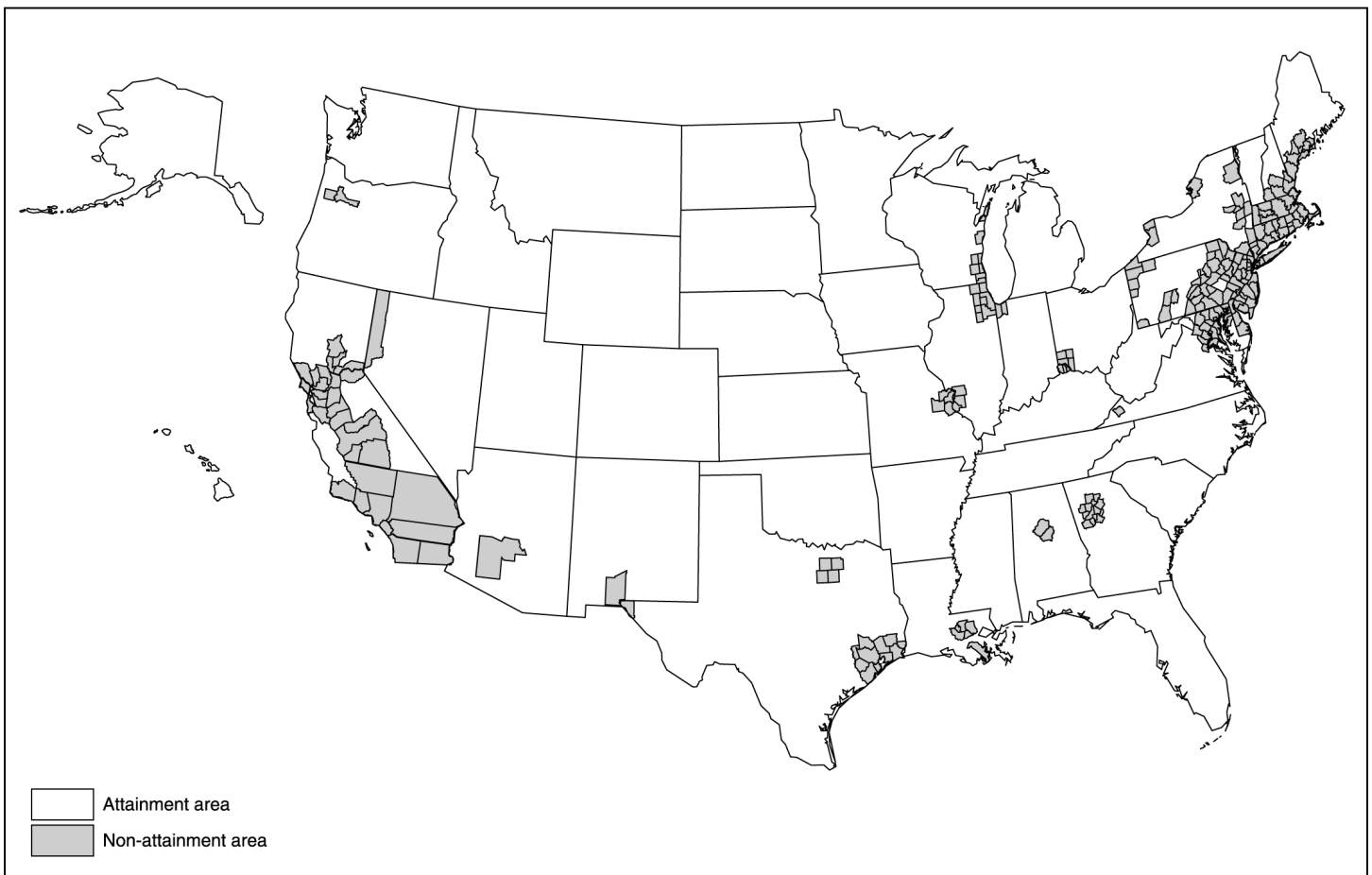
Figure 3: Ozone Non-Attainment Areas for EPA's 1-Hour Standard as of January 2002

the approved plants had to use more stringent controls, partly because 64 percent of the approved plants were located in attainment areas. 14