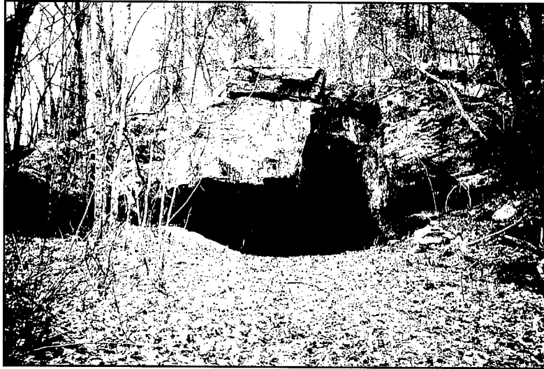
Figure 3. Blowing Wind Cave in northeastern Alabama is used as a roost site by gray bats

Gray bats may roost at man-made sites that simulate summer caves, such as abandoned barns (Gunier and Elder 1971) and storm drains (Hayes and Bingham 1964, Elder and Gunier 1978, Timmerman and McDaniel 1992). These drains have high humidity and clear running water, which are characteristics of natural caves used by gray bats. A few maternity colonies have been known to use man-made structures as maternity roosts. Lamb (2000) described a maternity colony using a gate-room at Woods Reservoir Dam at Arnold Air Force Base (AFB), Tennessee; this site was listed as a priority two maternity colony in the USFWS Gray Bat Recovery Plan (Brady et al. 1982). Another gate room of the dam is used by a bachelor colony (Lamb 2000). Corps personnel should be aware of the potential for gray bats and other bat species to use reservoir dam facilities as roost sites.