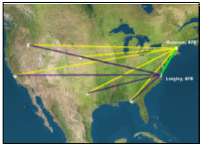
Simulation Based Acquisition (SBA)