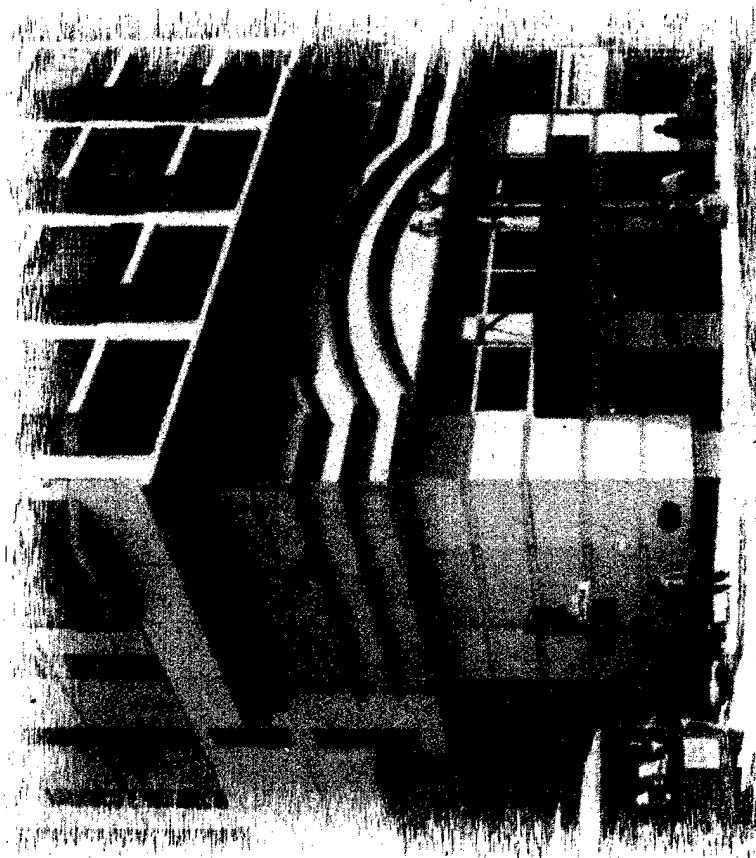
Crowne Plaza Union Square

Shuttle services are available at the airport at a rate of approximately $12 one way. Parking at the hotel is $29/day. Restaurants, shopping, and other attractions can be reached by walking or taking the trolley.