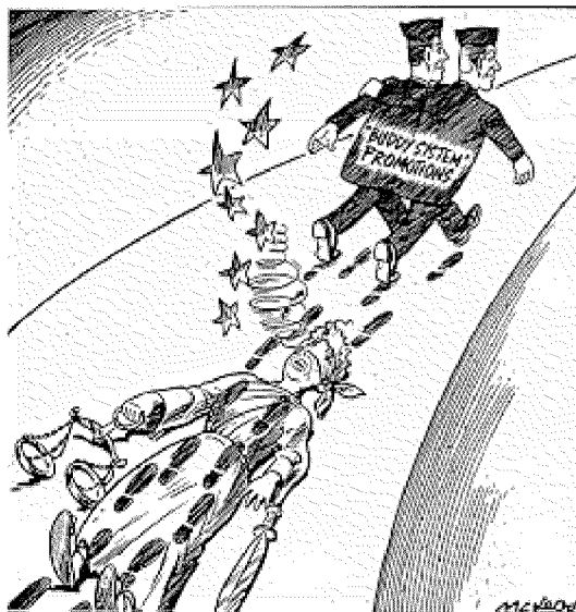
Figure 2. Air Force Promotions?

Embarrassing cases such as these stimulated the services into developing DoD Directive 1320.12, Defense Officer Personnel Program, which included mandatory procedural requirements for the conduct of promotion boards. The Air Force actively participated in developing the directive, but curiously opposed including general officers