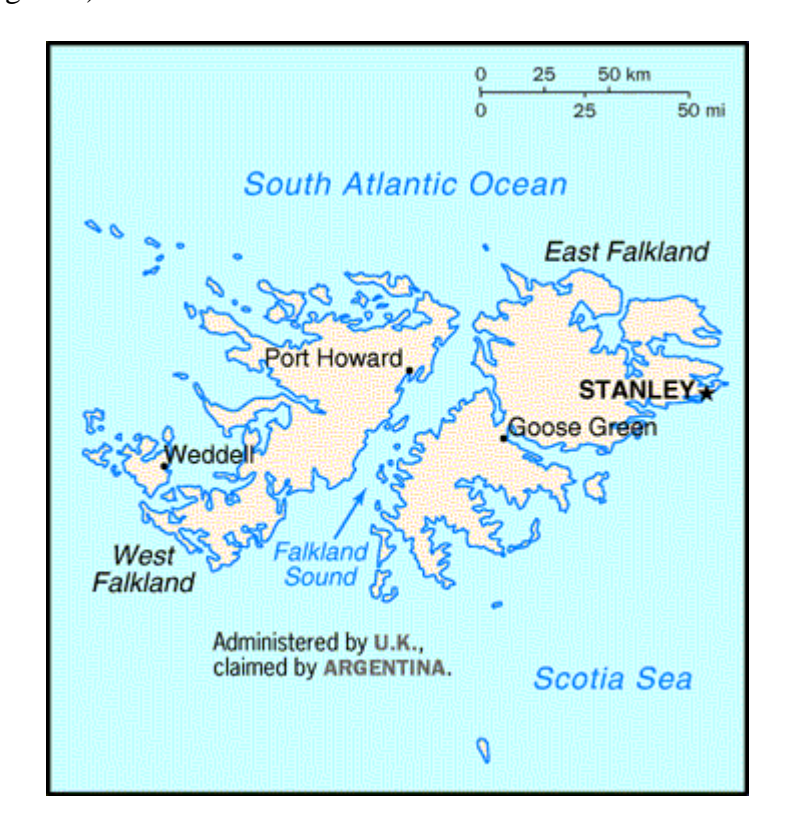
Figure 2. Location of Stanley and East Falkland Island.

The islands remained in a state of anarchy until 1833 when the British ship HMS Clio arrived and reproclaimed British sovereignty, again forcing all Argentineans to leave the islands. The Royal Navy sent additional ships and colonists to the islands, and built a large settlement at Stanley harbor (Figure 2). The islands have since remained under British rule.<sup>3</sup>