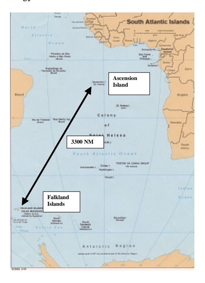
Figure 1. The South Atlantic.

weapons, and proved to be a significant source of naval lessons learned for modern students of maritime warfare. Designated Operation CORPORATE by the British, the five month war included the world's most significant amphibious operations since the Inchon landings in 1950, a logistics pipeline of over 7000 miles, and a winter combat arena 3300 miles from the nearest friendly base at Ascension Island (Figure 1). The Falklands' location 400 miles from land, away from major shipping lanes, provided a classic power projection scenario that highlighted many aspects of naval strategy and operations. Only political objectives and combat capabilities limited the application of forces. This perhaps even magnified naval aspects of the war, allowing more clarity as a case study in naval strategy.