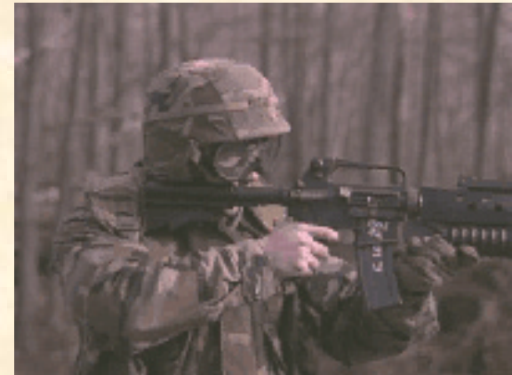
4. Small female soldier - M4