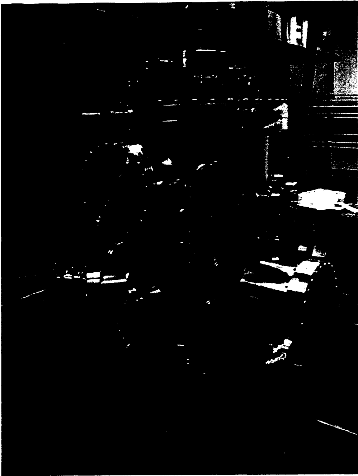
Figure 1. Vacuum Chamber