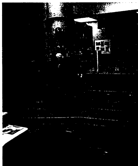
Figure 1 - the new Gatan enfina 2-D ccd energy-loss detector has a substantially narrower point-spread function and a quantum efficiency approximately 25 times that of the previous linear photodiode array detector.