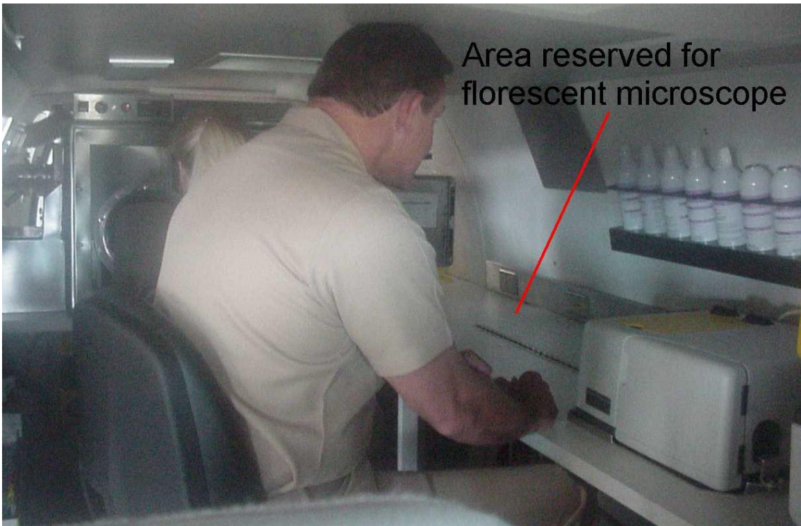
Figure 5. Space inside of the MALS with area reserved for fluorescent microscope labeled

The ELISA was identified by the U.S. Army Medical Research Institute of Infectious Diseases as the “gold standard” of identification technology for three biological agents on the high probability list. As of September 15, 2000, the biological detection and identification capability of the fielded MALS is limited to bio-immunoassay tickets [bio-tickets] produced by the Joint Program Office for Biological Defense. The Joint Program Office for Biological Defense has management responsibility for all DoD biological defense acquisition programs. According to officials at the West Desert Test Center at Dugway, experienced and trained personnel who teach courses on the proper use of bio-tickets had difficulty with the bio-tickets because of high rates of false positive and false negative readings. In their opinion, the requisite skills required to use the bio-tickets and obtain trusted results are perishable and require constant training. Without all the originally planned equipment in the MALS, such as ELISA, and training to operate it, the WMD-CSTs will not be able to provide timely and effective biological agent identification to incident commanders and will not be able to protect public health and safety.