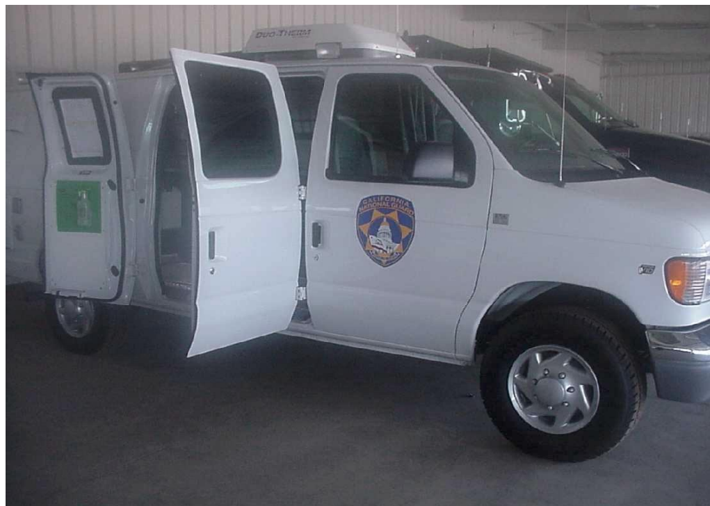
Figure 1. MALS

Mobile Analytical Laboratory System. The MALS design does not adequately accommodate the mission need. According to CoMPIO officials, the MALS was intended to be a platform for currently fielded lab equipment as well as emerging technology. The platform that was chosen, however, does not provide adequate physical space for the currently designated components or laboratory operations conducted by two people wearing chemical protective gear deemed necessary by the WMD-CST MALS operators. Discussions with officials from the organizations involved in developing the MALS that CoMPIO fielded revealed that engineering of the MALS was not adequately managed to produce a system capable of meeting mission requirements. Further, no analysis was conducted to compare the capabilities provided by the MALS with those of other existing military or commercial systems.