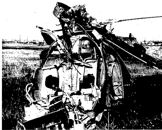
Wire caught left skid of OH-6A during low level recon of river. Helicopter crashed in water and sank.

A probable or suspected cause was listed as improper supervision within the unit of flight planning procedures, disregard of basic safety regulations, and false impression on the part of the pilot that the powerlines ran parallel to the intended route of flight.