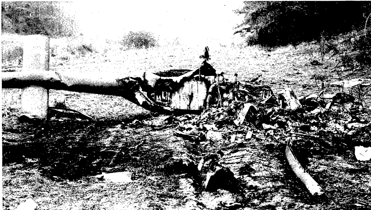
OH-58 pilot flew too low and helicopter struck wires, crashed, and burned.

close to the ground. It entered a small valley in which three strands of 1-inch wire cable were strung from power poles on both sides of the valley. The aircraft was flying approximately 30 to 40 feet above the ground with the troop-carrying ship to the left rear and above the lead ship. The pilot of the troop-carrying ship advised the scout ship that the valley contained wires. The pilot of the OH-58 acknowledged and was seen to increase his altitude for a short while and then return to his previous low altitude. After about 1 minute, the troop-carrying ship again advised the OH-58 pilot that there were wires 30 feet to his front. The OH-58 came up momentarily, descended again, and then appeared to climb just prior to hitting the wires. It contacted the wires at 42 feet AGL. Breaking through the wires, the pilot made a left pedal turn approximately 200 degrees and the OH-58 continued to the ground in an apparent controlled attitude. Upon impact with the ground, it exploded into flames and came to rest on its left side. There were two fatalities. The cause of the accident was attributed to the aviator flying at an unnecessary low altitude and high air-speed for mission accomplishment and failure to respond to a warning of imminent wire dangers.