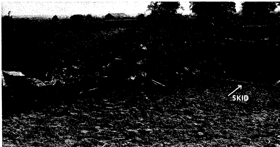
UH-1H struck powerlines approximately 80 feet above the ground in IFR conditions, crashed, and burned. Crew did not check weather prior to departure.

Of all the helicopter wire strikes, 81 occurred below 50 feet AGL. Thirty-four wires were hit during takeoff and 17 during landing. Eighteen mishaps occurred during autorotation. It is difficult to believe that wire encounters during simulated autorotations are allowed to occur, particularly during training exercises and in authorized training areas. This definitely reflects a lack of commonsense, education, and knowledge concerning low level flying, plus lack of air or ground reconnaissance of landing