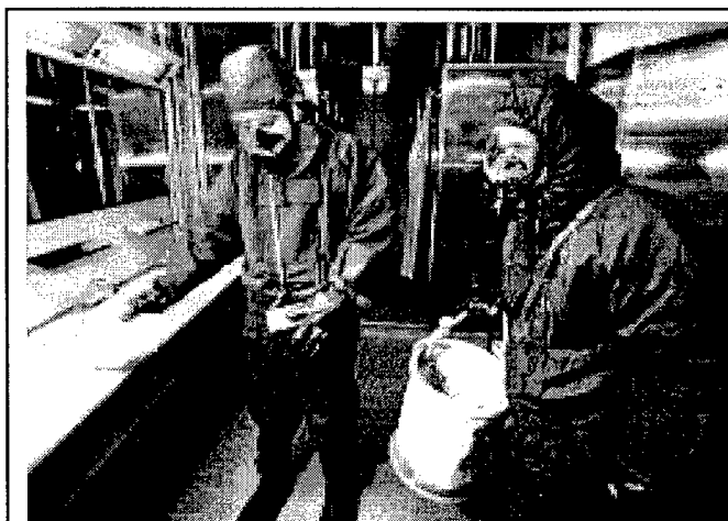
An NBC investigation team aboard the USS George Washington searches for "contamination" using M8 paper and an M256 kit during a recent drill.

The paper details the sensitivity of the M256-series chemical agent detector kit, which detects chemical warfare agents at much lower concentrations than other detectors U.S. forces had during the war. To prevent injury and death, the detector had to be able to detect chemical agents in concentrations lower than those that would injure service members. Those levels were established from laboratory research, from observing workers who were accidentally exposed and from other real-life examples, such as in the case of American doctors who treated Iranian soldiers after chemical agents were used against them in the Iran-Iraq war.