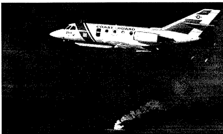
HU-25 Falcon aircraft on the scene at a Kuwaiti oil fields fire during the Gulf War.

The complete report can be found on GulfLINK ( http://www.gulflink.osd.mil ). Over the next several months, the Department of Defense anticipates the release of several additional reproductive health studies.