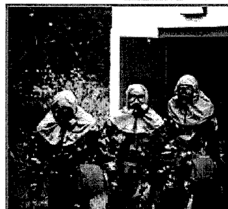
OSAGWI team members emerge from the gas chamber at the Marine Corps base in Quantico, VA, during a recent MOPP and chemical detection equipment seminar.

All of these case narratives are issued as draft or interim reports, and can be requested by mail, or found on GulfLINK ( http://www.gulflink.osd.mil ).