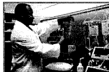
Army medical researcher in action.

A list of the fiscal year 1997 Gulf War illnesses research awards follows: