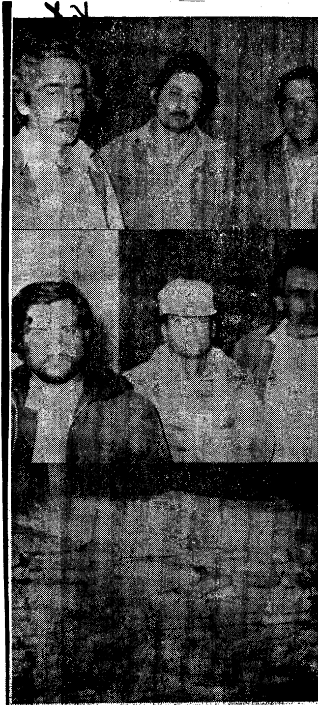
In the pictures above are six of the seven men arrested yesterday with more than a ton of marihuana by the Federal Judicial Police. Below is part of the load of marihuana confiscated in Caborca and Altar.