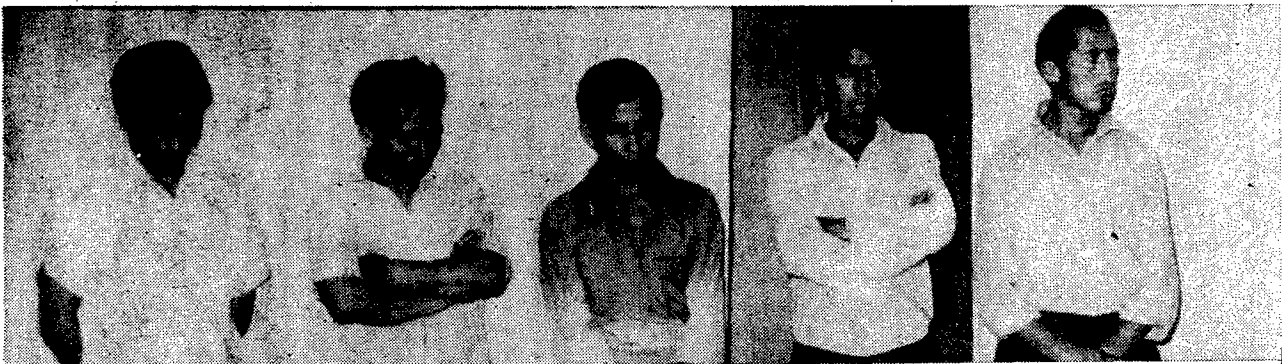
These are the five drug traffickers who were captured by the police, and from whom was seized cocaine base.

The five drug traffickers had well organized and well defined branches throughout the nation. According to the police, their supply centers may be Tingo Maria and Huancayo.