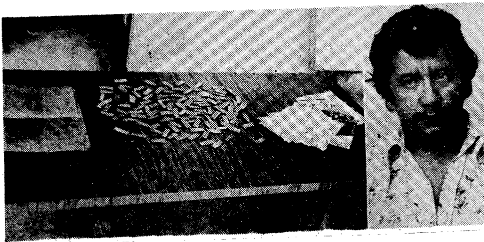
Fausto Mota Ruiz Captured

The prisoners will be turned over to one of the criminal judges for legal action.