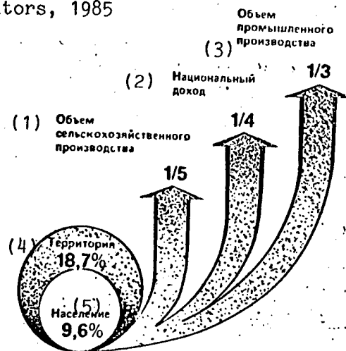
Figure 4. The share of the CEMA member countries in world totals for the most important indicators, 1985