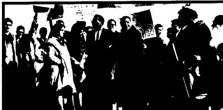
AFOSR and the development of the LASER ...continued from page 1

In 1951, Dr. Townes conceived the idea of the maser, and a few months later he and his associates began working on a device using ammonia gas as the active medium. In early 1954, the first amplification and generation of electromagnetic waves by stimulated emission were obtained. Dr. Townes and his students coined the word "maser" for this device, which is an acronym for M icrowave A mplification by S timulated E mission of R adiation.