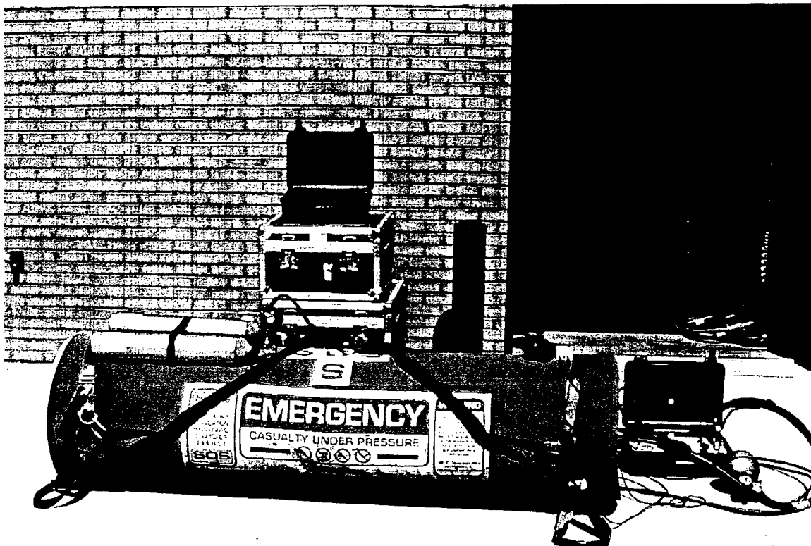
ILLUSTRATION A-1. SOS HYPERLITE EEHS SYSTEM