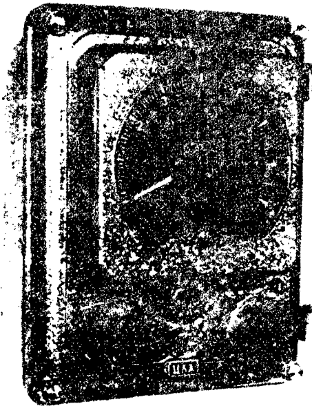
Fig. 2. Automatic block-type pH-meter TsLa.

The Lenteplopribor plant has started serial production of TsLA's pH-meters (according to information given by representative of the plant, P. F. Shmidt).