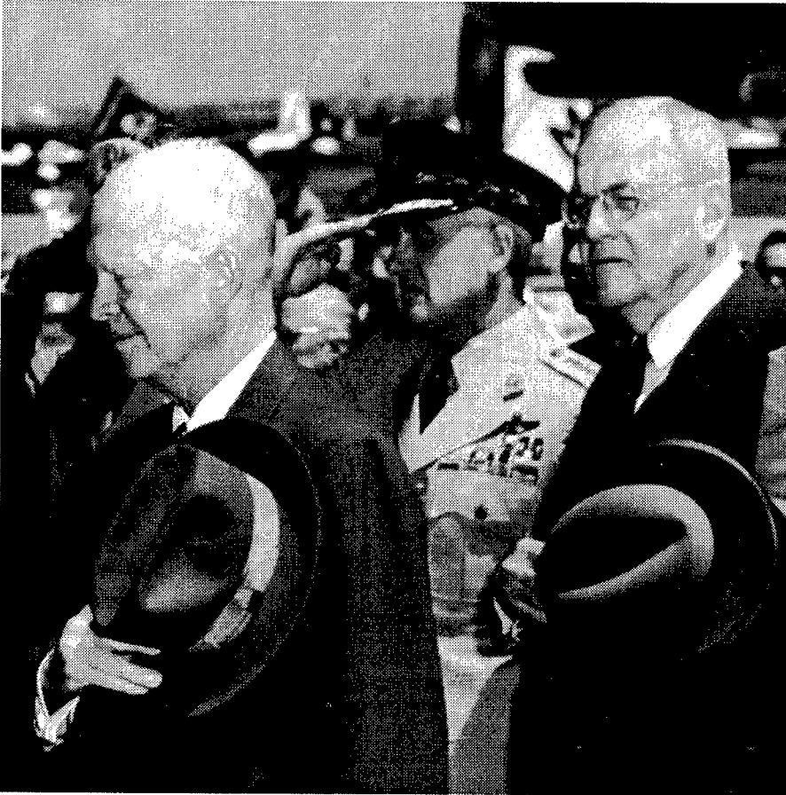
President Dwight D. Eisenhower, Gen Nathan F. Twining, and Secretary of State John Foster Dulles

establishment of its Special Commission for Interplanetary Communications, making reference to a globe circling satellite program. 28 In 1955 the US was completing the formulation of its first space policy, but it did so in a somewhat ambivalent manner. The United States assumed that its space program was technologically superior to the USSR's space program. Indeed, the US was far ahead of the Soviets in miniaturizing its warhead devices (which fact was highly classified at that time); however, as discussed later, this US advantage was to become a double-edged sword.