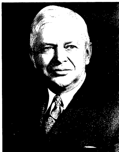
Secretary of Defense Charles E. Wilson

Some have concluded that the USSR was first in space by default because of Eisenhower's "ambivalence" and his secretary of defense's penchant for fiscal conservatism regarding space programs. 45 These factors might partially explain why the United States failed to be first in space. Other factors explain why the USSR was first in space with Sputnik . * First, Eisenhower had been assured that physics precluded dropping a bomb from a satellite in orbit; therefore, he was not concerned about a surprise attack from outer space. Second, the Eisenhower administration did not fully appreciate the "psychological shock value" of a successful Sputnik launch or the reaction of the American people to having Sputnik overhead. 46 Third, Eisenhower's administration did not appreciate fully the propaganda and prestige value of being "first in space," 47 despite warnings to this effect by the