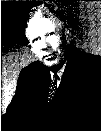
Secretary of Defense Neil H. McElroy

peaceful uses of outer space. This shift in focus was evidenced within the Air Force by an Air University (AU) study regarding the control of outer space. This study, mentioned earlier, diverged from the existing Air Staff position particularly regarding AU's proposal that an international group should codify rules governing the use of outer space. However, the AU study further recommended that any space vehicle on an orbit, trajectory, or unapproved flight plan deemed inimical to the interests of national security should be considered hostile and that