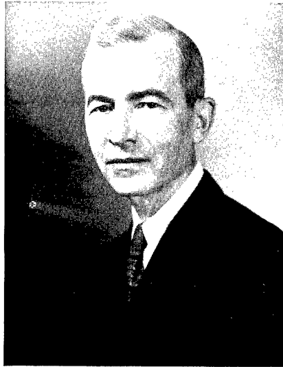
Secretary of the Air Force Donald A. Quarles

with heavy throw weights (thrust). In fact, in the years before Sputnik , the Air Force had actually reduced the number of stages in its Atlas program. Because the USSR warhead devices were larger and heavier, they required the concomitant development of rockets with greater thrust than did the US devices. While the United States was ahead in being able to deliver a hydrogen warhead more precisely anywhere on earth, the USSR had rockets with greater thrust and throw weights that were advantageous for launching objects into outer space. The US focus on attaining a technological/miniaturization advantage was disadvantageous to its being first in space. 48