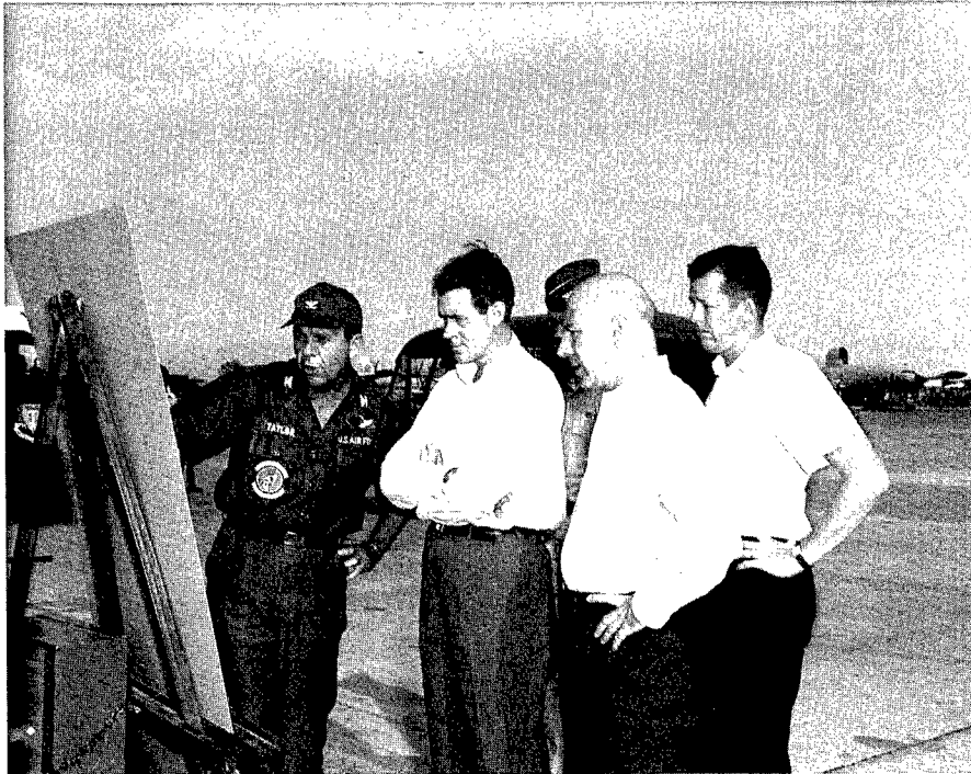
Cyrus R. Vance (center, arms crossed) gets briefing in Vietnam while serving as secretary of defense. Vance had earlier served as general counsel in DOD and played a key role in formulating the Kennedy administration's space policy, especially as it related to international law.