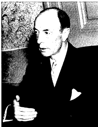
Robert A. Lovett, Assistant Secretary of War for Air

The purpose of the subcommittee was to "provide machinery to develop and coordinate the policies which would guide the positions to be taken by the US delegation to the Legal Committee" of the ICAO. 6 The Air Force, which only recently had been separated from the Army, was assigned as the working group for this effort. With the Air Force concurring, the ACC encouraged US compliance with all ICAO recommendations except when, among other reasons, the implementation would be detrimental to the national interest. 7