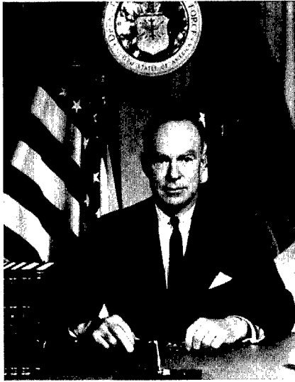
Dudley C. Sharp. Sharp served in various high-level offices in the Air Force, eventually becoming secretary of the Air Force in 1959.

vention regarding the use of outer air space." Sharp encouraged the other services to also review the issue. 18