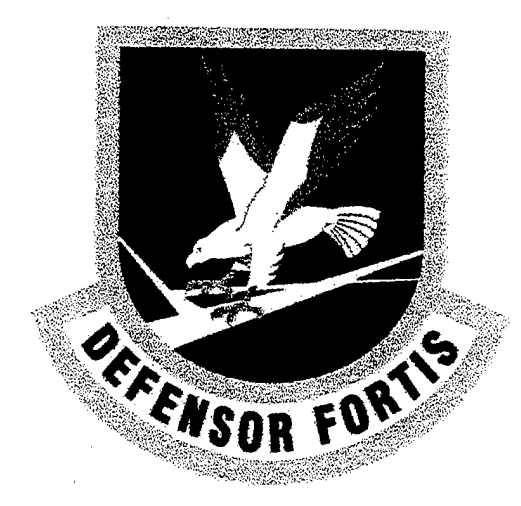
Figure 1 Security Forces Flash Design

COA 5: A complete review of all training conducted at the Security Forces Academy was accomplished. A series of comprehensive Utilization and Training Workshops (Air Education and Training Command construct for validating new training requirements) were held to facilitate the merger and determine the best training program to assure Force Protection. This endeavor required a major and complete overhaul of all training programs, many still mired in the cold-war era. Now, the new Security Forces Academy training programs reflect a single, united security forces career field, with a new primary wartime mission. It also incorporates the new asymmetric threats in training scenarios and field exercises. This huge effort resulted in an entirely new interim and long-term training programs for the Security Forces Academy and USAF Air Base Defense Training Detachment at Camp Bullis, Texas.