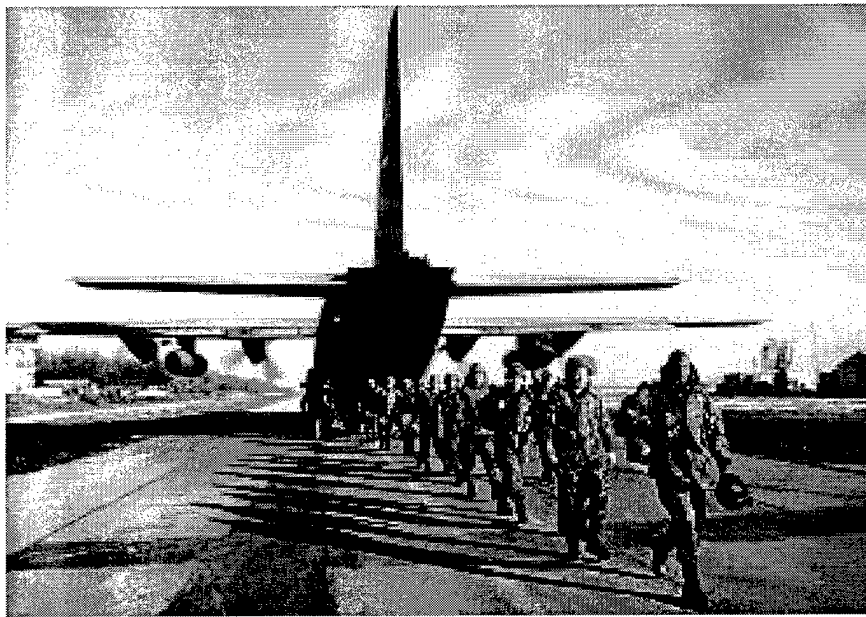
Disembarking in Tuzla.

and professional continuing education institutions. Finally, it will develop and offer an installation transportation office/transportation management office joint course. Common deployment doctrine and training are the overarching JDTC objectives. Through these tools, JFCs will be able to establish a truly effective joint force deployment team.