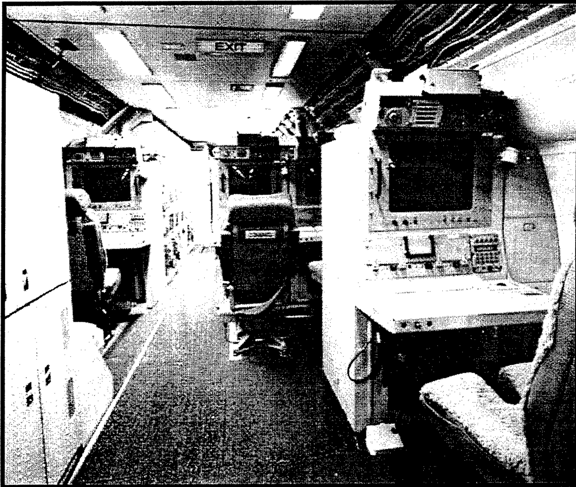
Figure 1: JSTARS Operator Workstations

Figure 1 below shows the workstation configuration aboard the E8-C JSTARS.