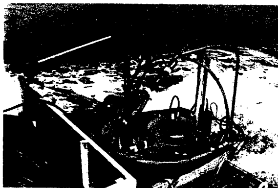
Fig. 1 Torsional source and cone penetrometer mounted on self-righting sled.

The 1993 work in Eckernfoerde and the Gulf of Mexico was supported by the CBBL program whereas the work in Italy and the 1995 work in Germany were supported by ONR (U.S. Liaison Officer to SACLANT Center) and SACLANT Center.