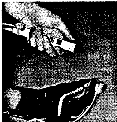
Fig. 1 Pinch Glove and Button Chord input devices showing placement of trackers.