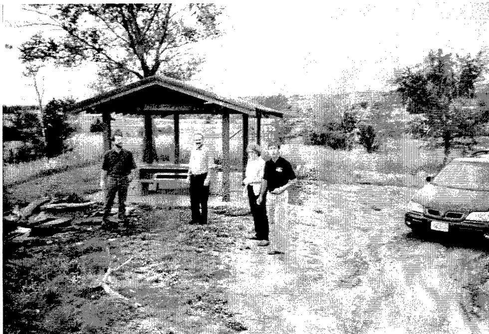
Figure 2. Many public-use areas, such as this one at Lake Sharpe, South Dakota, offer very limited capacity for Native American recreation events