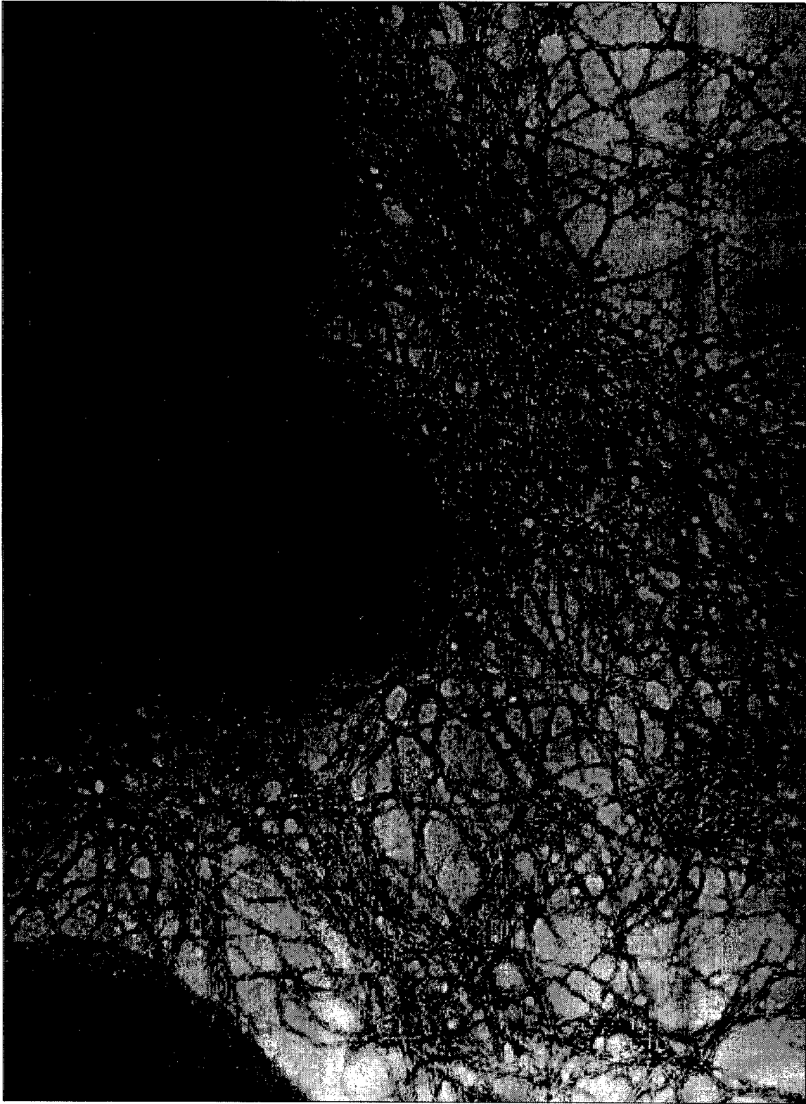
Figure 2. Transmission electron micrograph of Toronto/Edinburgh epidemic clone of B. cepacia expressing CF mucous-binding Cbi adhesin pili. High resolution was achieved by using a JEOL 100CX electron microscope and negative staining.