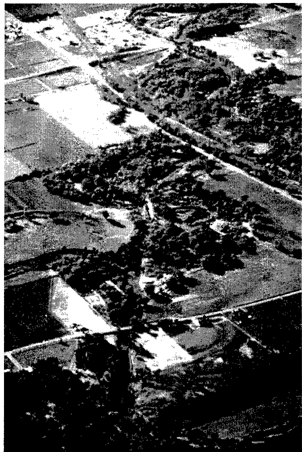
Riparian buffer zones remove nonpoint source pollution from adjacent land-use practices, such as agriculture, and also provide critical wildlife habitat

This article describes work to develop technical guidelines for restoring and managing riparian buffer zones and corridors. The potential benefits—with regard to water quality and many important ecological functions—are significant.