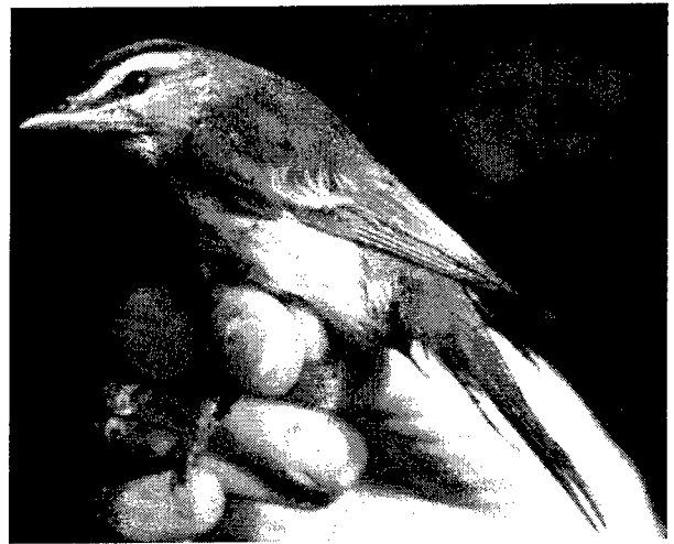
Some neotropical migrant songbirds, such as this red-eyed vireo, breed in buffer strips if enough interior forest habitat is available

The adverse impacts of these activities are often detrimental to riparian and aquatic habitats, especially where protective buffer strips are not retained or established and subsequently managed as part of the project plan.