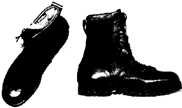
New stock system infantry combat boot

The prototype sole developed from these tests has a rubber Vibram outsole for durability and a polyurethane midsole and insole for cushioning. The shock