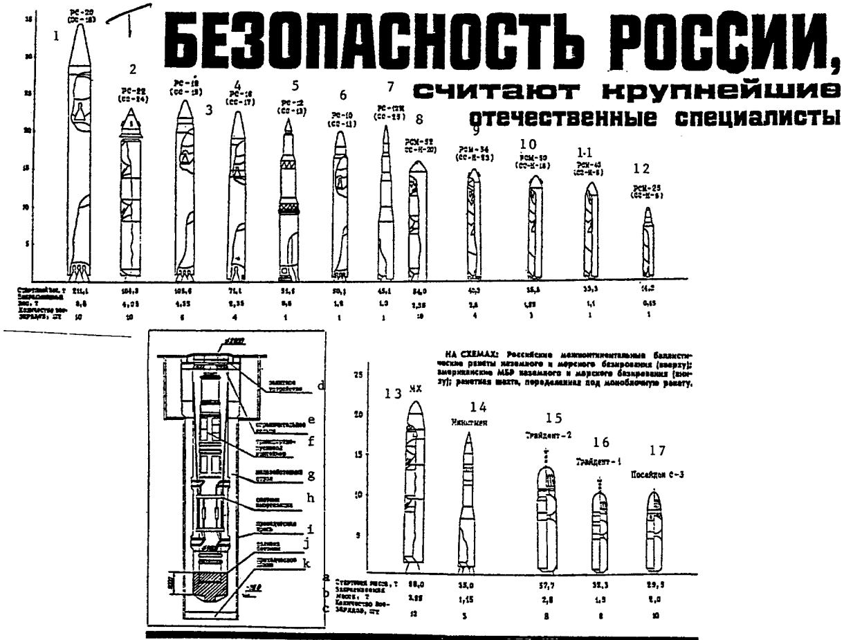
Russian Land-Based and Sea-Launched Intercontinental Ballistic Missiles (above); American Land-Based and Sea-Launched ICBMs (below); Missile Silo, Reconfigured for a Single-Warhead Missile

Key: 1. RS-20 (SS-18); 2. RS-22 (SS-24); 3. RS-18 (SS-19); 4. RS-16 (SS-17); 5. RS-12 (SS-13); 6. RS-10 (SS-11); 7. RS-12M (SS-25); 8. RSM-52 (SS-N-20); 9. RSM-54 (SS-N-23); 10. RSM-50 (SS-N-18); 11. RSM-40 (SS-N-8); 12. RSM-25 (SS-N-6); 13. MX; 14. Minuteman; 15. Trident-2; 16. Trident-1; 17. Poseidon S-3; a. Launch weight (tonnes); b. Throw weight (tonnes); c. Number of warheads; d. Protective cover; e. Stop ring; f. Transport-launch canister; g. Reinforced concrete shaft; h. Shock-absorber system; i. Silo wall reinforcement; j. Concrete filling; k. Silo bottom