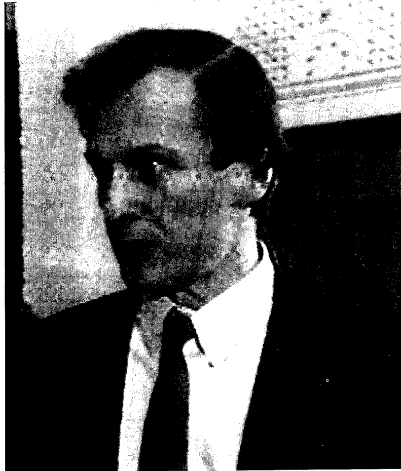
Environment Minister Yuriy Kostenko. Photo from Kiev Television, 5 March 1993

becoming increasingly dangerous through negligence and inadequate maintenance. He said the warheads' life span was far from exhausted.