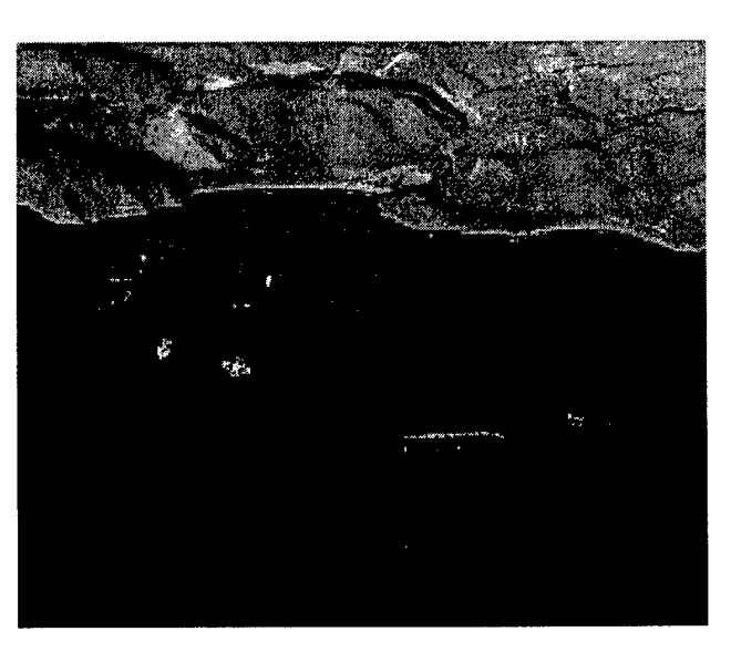
Stealth, or low-observable technology, is the greatest development in air combat technology in the past few decades.

First, stealth depends heavily on an aircraft's configuration. The design of the airframe must be such that features are shaped very specifically and precisely, and the vast majority of older aircraft designs are not stealthy shapes. Making them fully stealthy is prohibitive in that the aircraft would have to be virtually redesigned and rebuilt on a level similar to that of a newly-manufactured aircraft, which negates the cost savings of a refit.