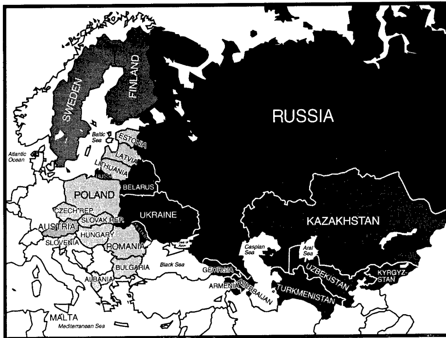
Figure 1. Europe/Partnership for Peace Nations

PFP force integration into tactical air operations poses a number of issues. The nations concerned possess widely diverse military forces. Additionally, peacekeeping operations could occur out of area, perhaps to assist PFP member-states; thus, the potential geographic area for NATO operations is large and varied. Military forces of PFP countries run the gamut from the small Latvian army to the Ukraine with its hundreds of strategic nuclear weapons. 44 Consequently, PFP members can be grouped roughly into four categories in relation to their likely effect on NATO tactical air doctrine.