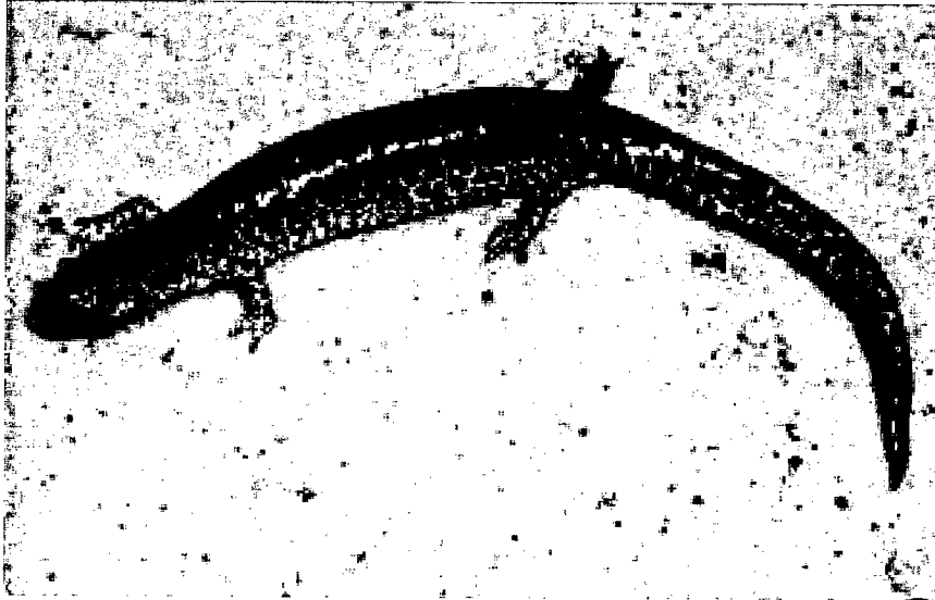
Flatwoods Salamander