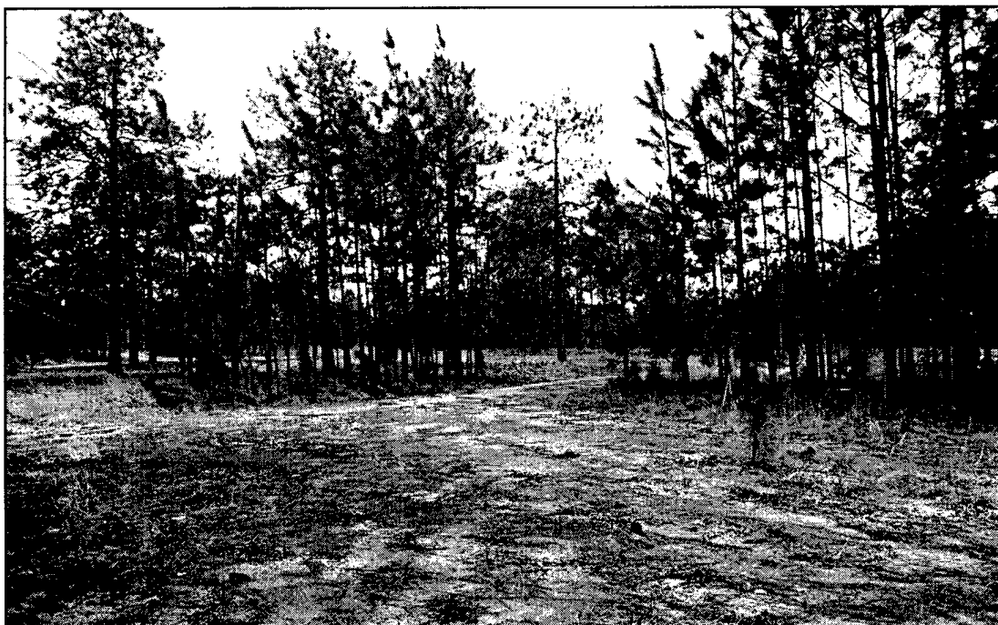
Figure 4. Wiregrass is still abundant near the edges of the occupation site.