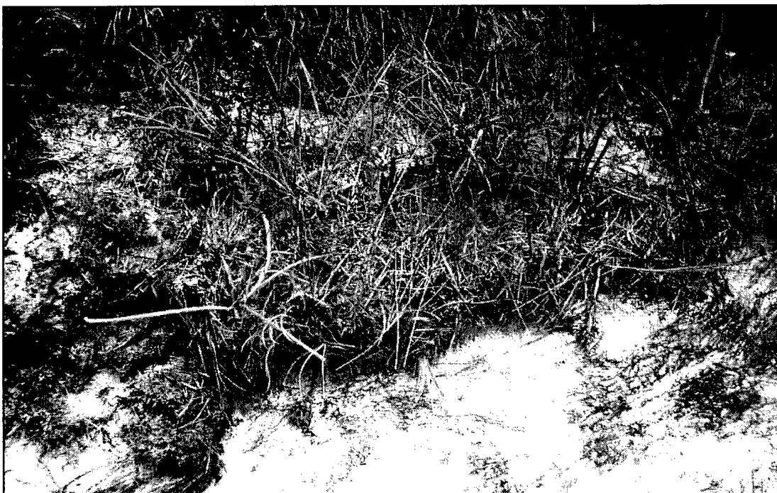
Figure 10. This bog area appears to be irreparably harmed after only a short period of use.

While on-road vehicle traffic, artillery practice, small arms ranges, and the use of smokes and obscurants should not harm these species, ORV traffic potentially can be detrimental (Jordan, Wheaton, and Weiher 1995). Threats were described as “ditching and draining,” “changes to hydrology,” “drying of habitat,” “soil compaction,” and “trampling” (Jordan, Wheaton, and Weiher 1995). Russo et al. (1993) also listed direct physical destruction and ground disturbance as threats to populations of American chaffseed, Carolina grass-of-Parnassus, and smooth bog-asphodel. Drainage of habitat is the most significant threat to Chapman's rhododendron ( Rhododendron chapmanii ) due to its narrow tolerance of moisture levels (USFWS 1983).