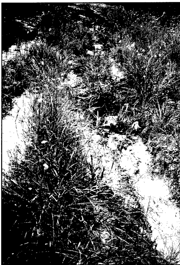
Figure 9. A bog that recently became an off-road tank maneuver site shows bog species persist near deep ruts that are channeling water and soils downslope.

While on-road vehicle traffic, artillery practice, small arms ranges, and the use of smokes and obscurants should not harm these species, ORV traffic potentially can be detrimental (Jordan, Wheaton, and Weiher 1995). Threats were described as “ditching and draining,” “changes to hydrology,” “drying of habitat,” “soil compaction,” and “trampling” (Jordan, Wheaton, and Weiher 1995). Russo et al. (1993) also listed direct physical destruction and ground disturbance as threats to populations of American chaffseed, Carolina grass-of-Parnassus, and smooth bog-asphodel. Drainage of habitat is the most significant threat to Chapman's rhododendron ( Rhododendron chapmanii ) due to its narrow tolerance of moisture levels (USFWS 1983).