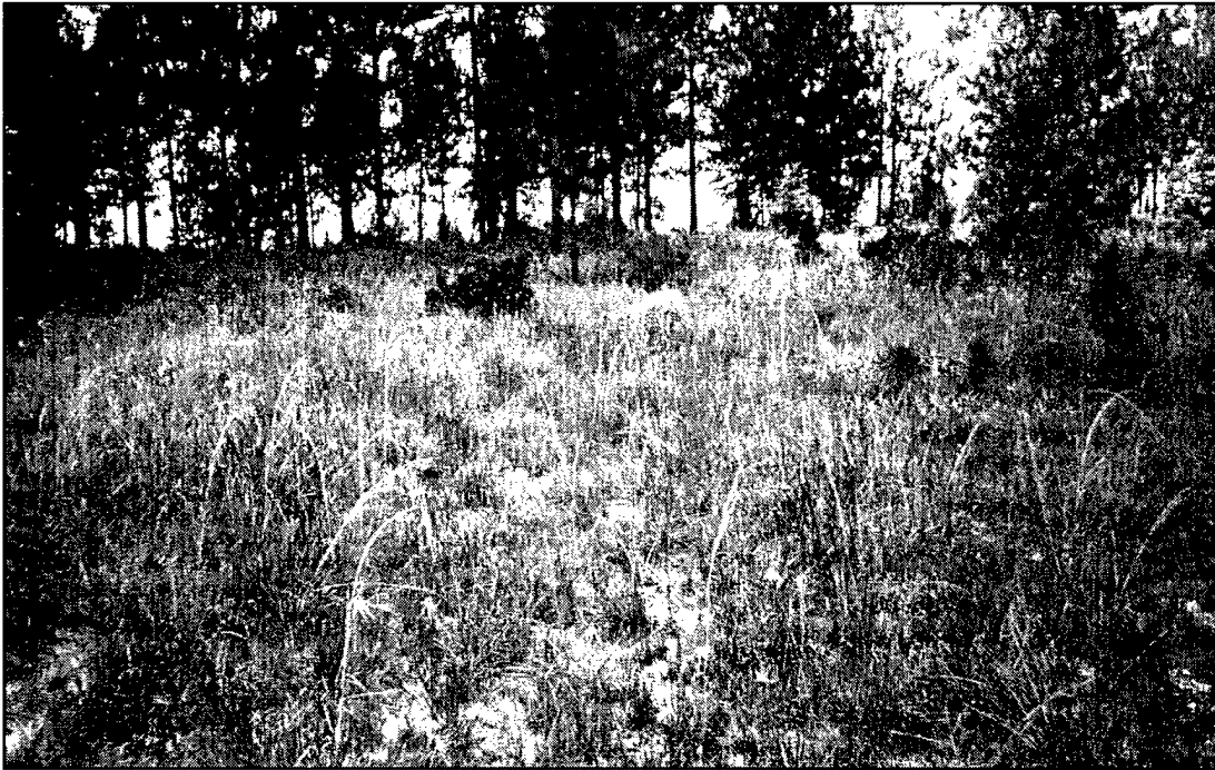
Figure 8. A bog drained by tank ruts is now dominated by wax myrtle and St. John's Wort—deep ruts remain under the vegetation.

wetland communities and mechanized vehicle training are incompatible in the southeastern United States (LeBlond, Fussell, and Braswell 1994b).