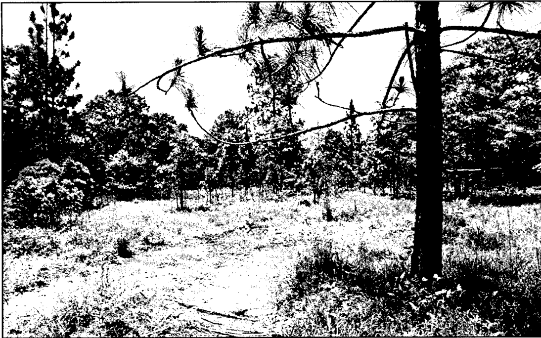
Figure 6. Off-road tank traffic in flatwoods community led to rutting, ponding, fire suppression, and consequential changes in the composition and structure of the community.

community, usually into lower areas such as streambeds (Russo et al. 1993). O'Neil et al. (1990) predicted rutting depths in soils at Yakima Training Center, WA, under four military force training levels, and identified three threshold levels of training intensity. Unfortunately, this type of information is not available for locations in the Southeast. At some (unknown) level of intensity, soil disturbances and altered hydrology will significantly alter the community structure and composition, and these impacts will remain until normal water flow is restored (LeBlond, Fussell, and Braswell 1994a). These impacts can be serious for wet pine woodland communities. Prescribed burning alone cannot maintain these communities if the water flow is channelled away through ditching and rutting (FNAI 1994).