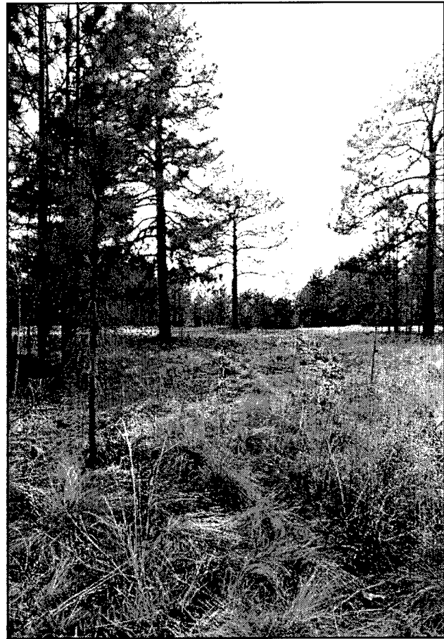
Figure 3. Although this occupation site has lost some vegetation, abundant longleaf pine regeneration can be seen in persistent forest islands.

Recreational ORV use may be similar to off-road maneuver effects. One study compared the effects of 1, 10, 100, and 200 straight-line passes of motorcycles at a constant velocity in the Mojave Desert, CA. After one pass, the path was visible. After both 100 and 200 passes, berms formed along the path, and 10 to 30 mm of soil was displaced from the cycle track. Soil compaction was significant in all four treatments. Compaction was greatest immediately below the soil surface. Higher speeds led to less compaction but greater soil displacement (Webb 1983).