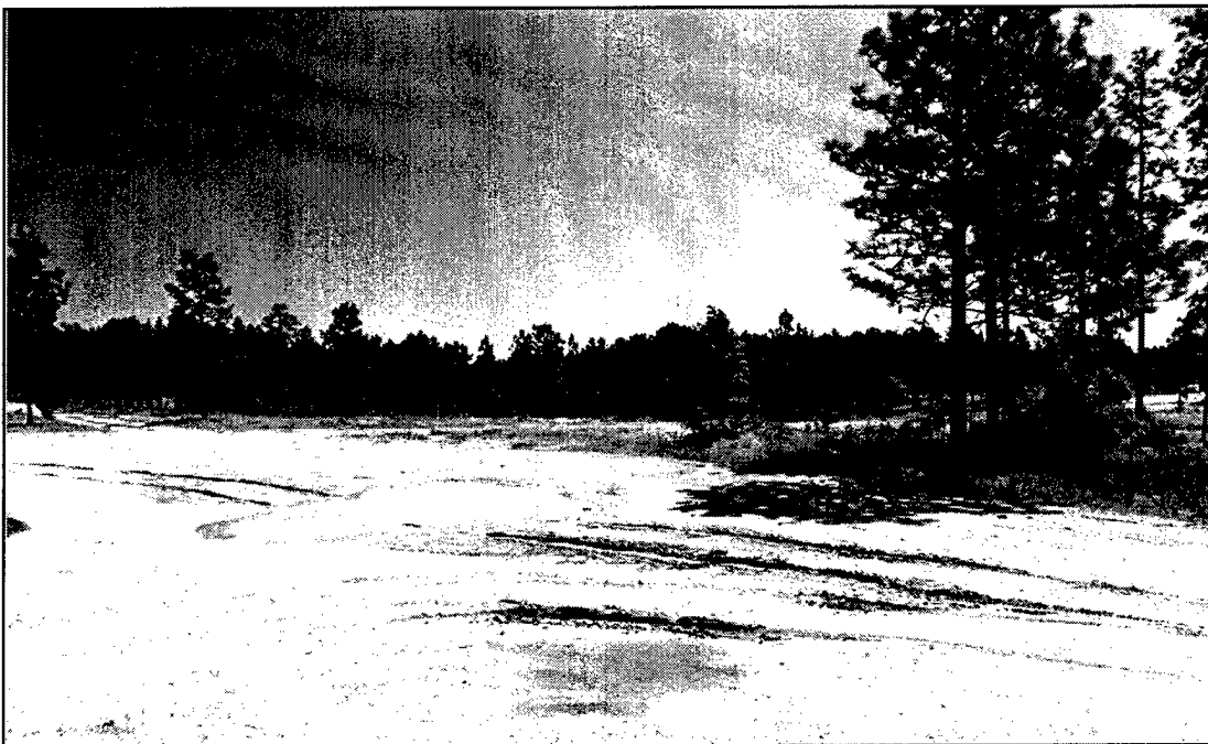
Figure 5. Assembly areas and tank maneuver sites become barren, which fragments fuel sources and prevents fire from carrying over large areas.

Another potential concern on military lands is that burning may not be possible because troops are present in the field. Coordination between range control personnel and prescribed burn teams would improve the chances that proper burns are conducted as needed for TES requirements without limiting the ability of military units to train. The magnitude of this impact varies from installation to installation. It may be a greater problem where communication and staff are more limited, or in cases where weather patterns restrict opportunities for prescribed burns.