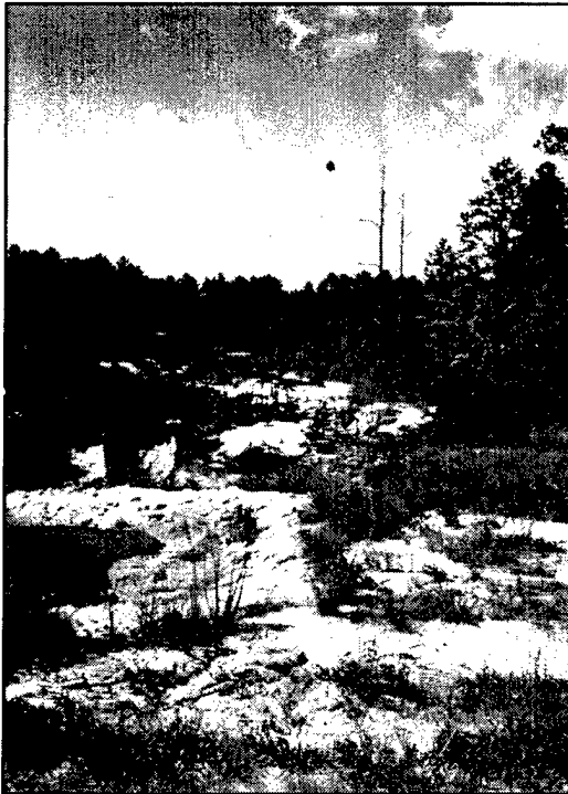
Figure 1. Severe sedimentation in a natural stream caused by intensive tank maneuvers in nearby upland areas.

is a potentially serious threat and should be frequently monitored in any wetland community that harbors TES.