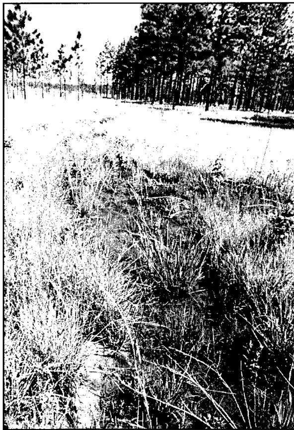
Figure 7. Tank traffic through a bog left deep ruts, which fill with water and channel overland water flow—pitcher plants ( Sarracenia spp.) no longer grow along the ruts because the soil is too dry.

Even relatively minor ruts will persist in a wetland community, possibly for decades (M. MacRoberts). Mechanized traffic can alter the underlying hardpan layer as