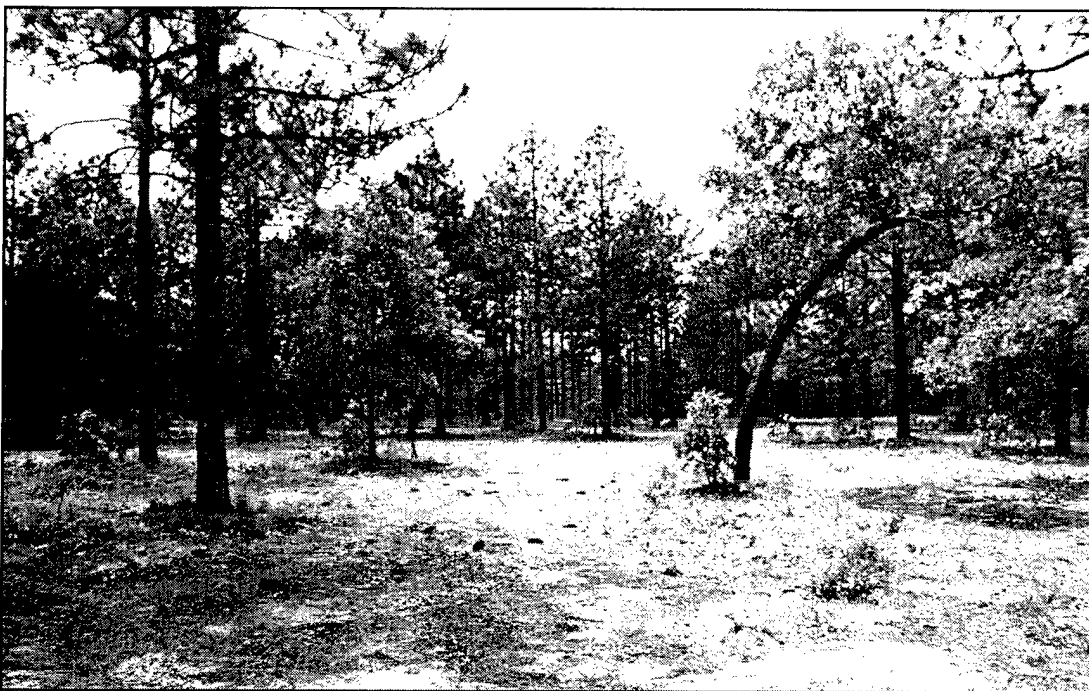
Figure 2. Damage to soils (compaction), groundcover, and overstory trees typical of areas used for intensive occupation exercises.

Despite the severe consequences of occupation in some locations, it is possible for ongoing occupation activity to have little impact on soils or vegetation. One site on Fort Bragg is used frequently but does not show permanent damage (A. Trame, pers. obs.). Although many areas within the occupation site are cleared of vegetation, there is no apparent erosion, and regeneration of longleaf pine is occurring in widespread islands of vegetation (Figure 3). Healthy stands of wiregrass grow immediately adjacent to places that receive concentrations of traffic (Figure 4). The plant community that supports this occupation site (drier sandhill community on flat terrain) appears to be fairly resilient to military activities. More research may