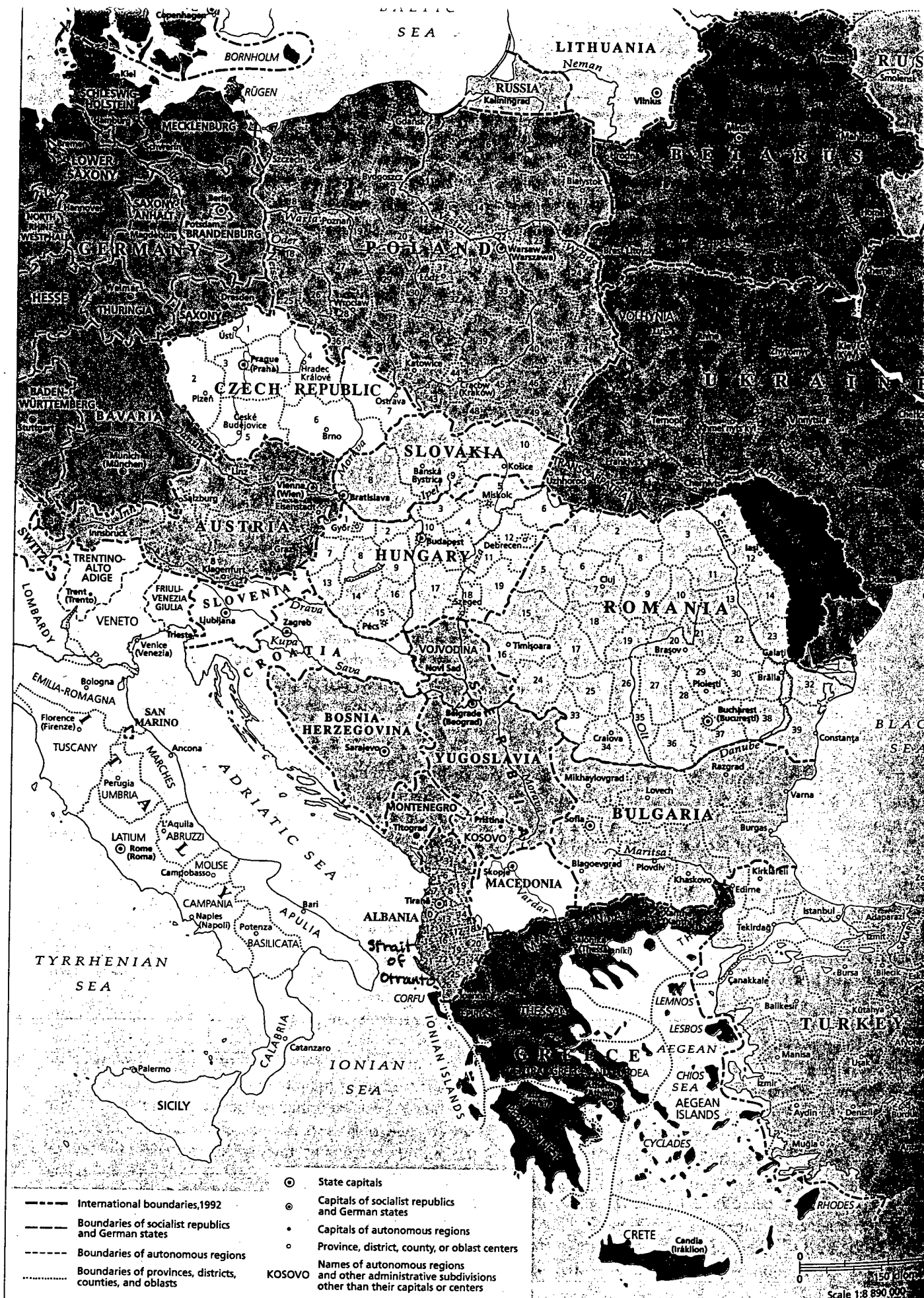
Historical Atlas of East Central Europe