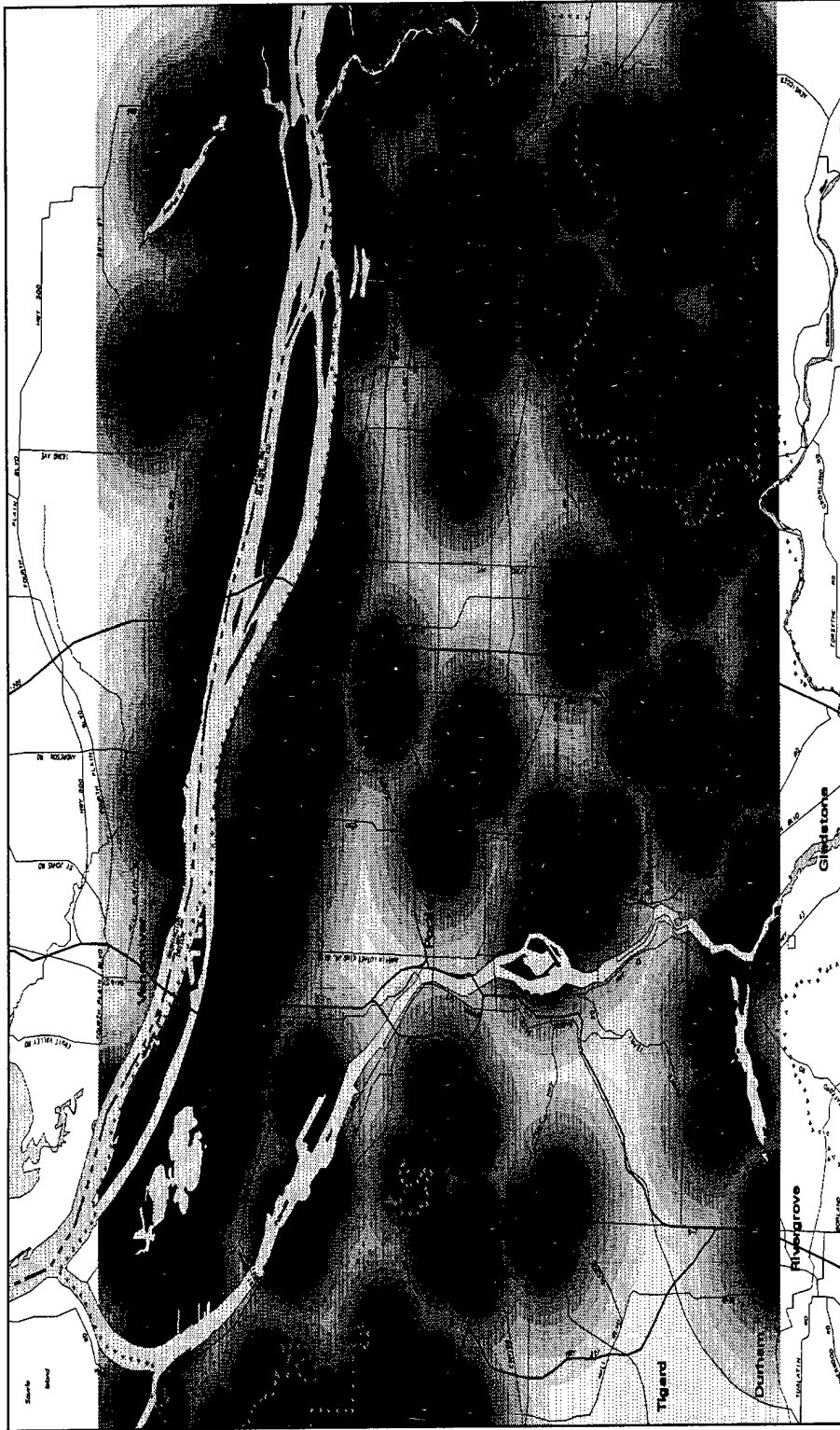
Figure 1. Open Water Wetlands in the Greater Portland Area. Lighter Shading Represents Greater Distance from a Wetland Site.