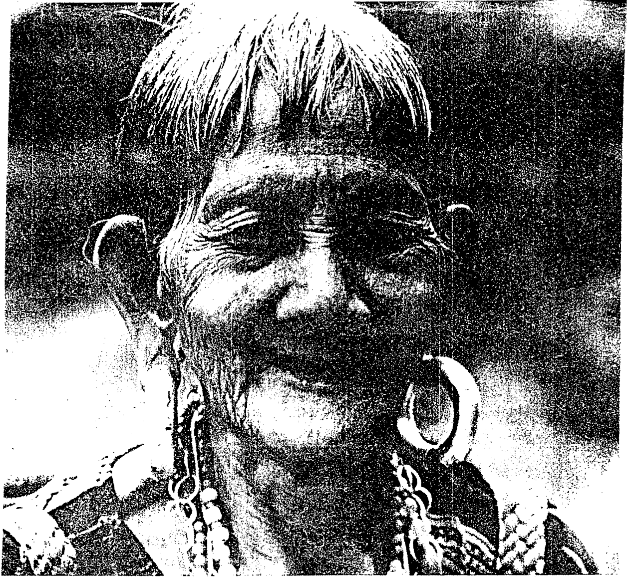
Figure 1. A Bru (Pa Ko) Woman