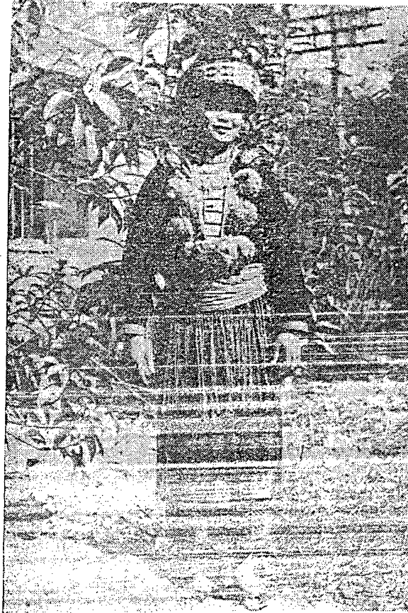
Figure 3. A Girl of the Dao minority (Ha Tuyen province)