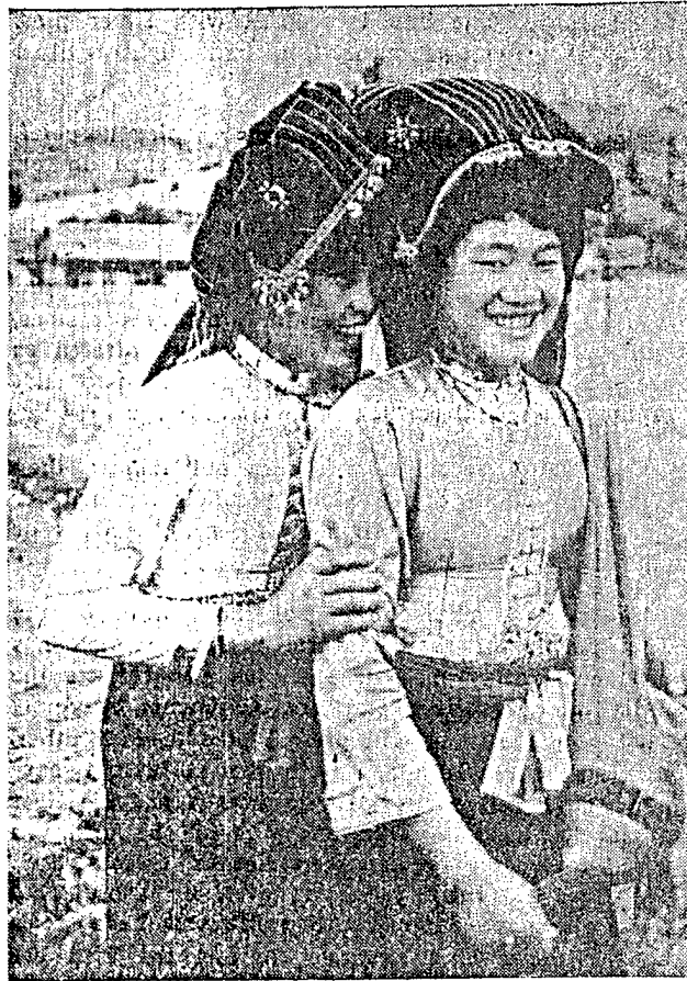
Figure 8. Thai Girls of Dien Bien Area (Lai Chau Province)