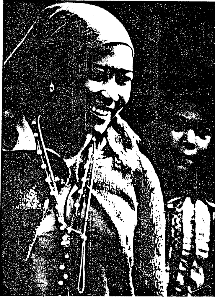
Figure 2. Co Ho (K'hor) Girl