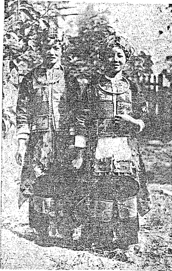
Figure 6. Girls of the Lo Lo Minority (Ha Tuyen province)