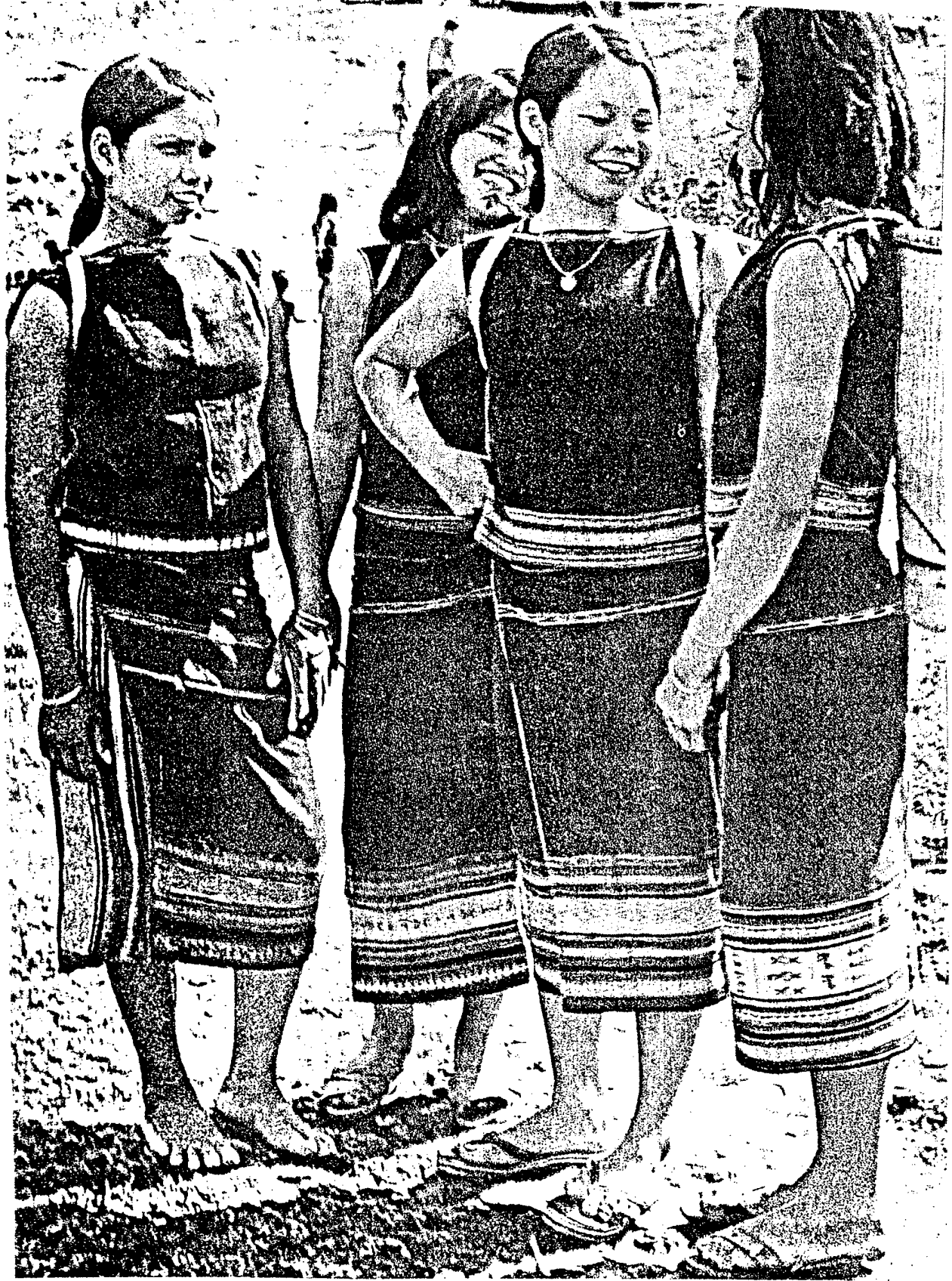
Figure 4. Gia Rai Girls