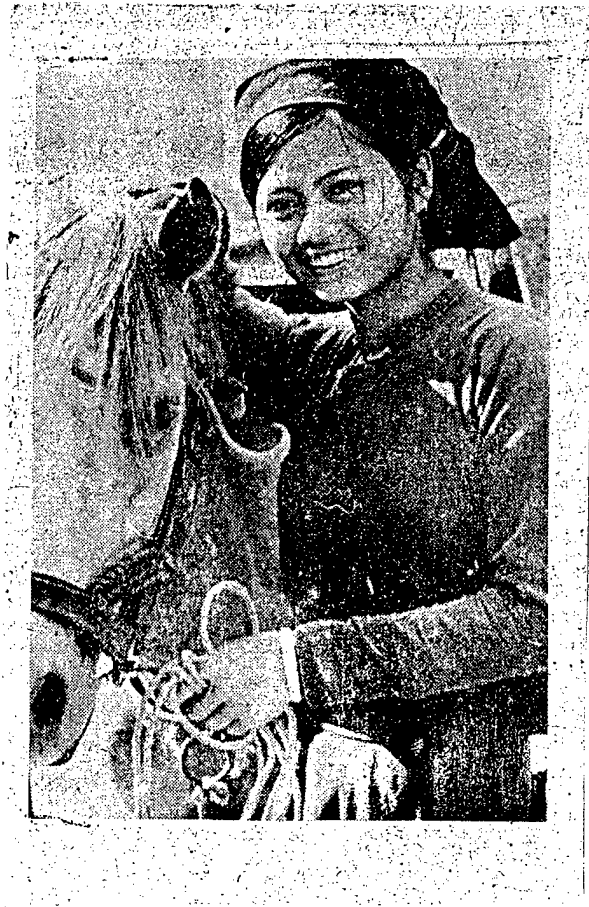
Figure 7. Tay Girl