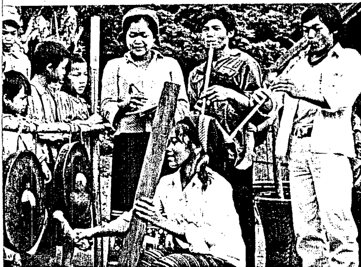
Figure 5. Khmu Festival