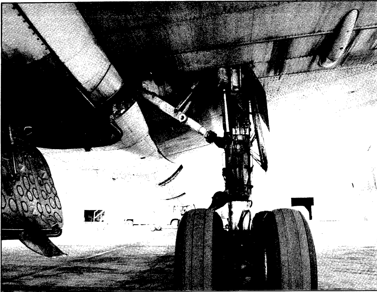
Figure 1. Wheel-Well Passenger Stow-Away Space. it is forward of DC-8 Right Main Landing Gear, Wing Root Area.

When the landing gear retracts in jet aircraft, metal covers close over the opening where the wheel and strut are positioned when the gear is extended, thus reducing in-flight air drag and further securing a stowaway.