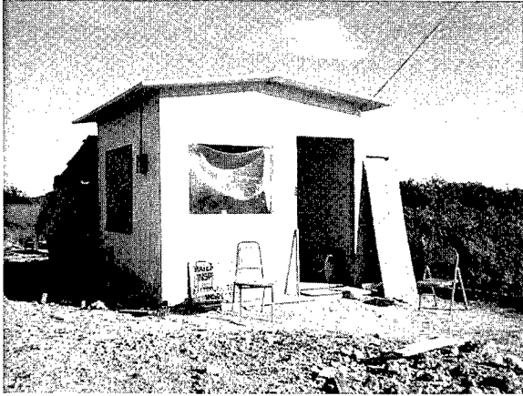
When the entrance is unguarded, the site is vulnerable to illegal disposal of hazardous and dangerous industrial wastes.