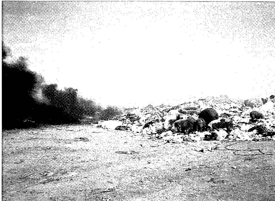
Open incineration of waste produces smoke that impairs the area's air quality.