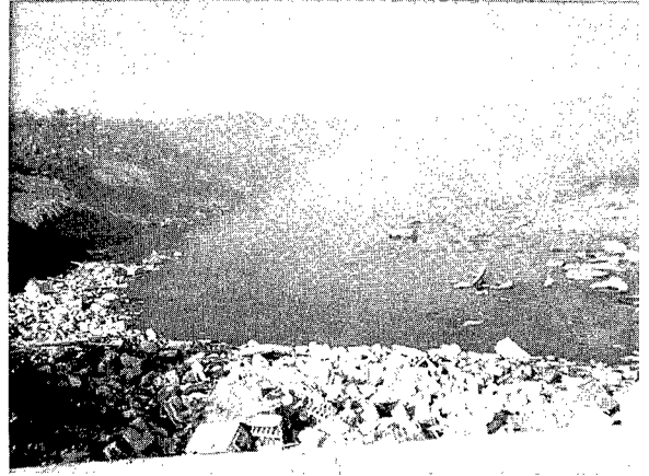
Raw sewage flowing in an open canal poses a health threat to area residents.