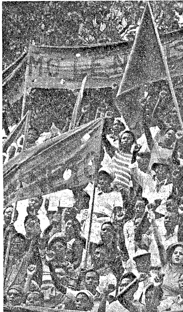
Solidarity Meeting in Angolan Streets

(Excerpt) Angola is confidently building a new life. During a short period after the declaration of independence in 1975, the country reached success in various levels of life. The MPLA - Workers' Party is taking measures to adjust industrial and agricultural production and to find solutions for building a railroad. However, the Republic is coming into great difficulties. The essential obstacle to the path of development is the poor military/political relationship with South Africa. As a result of the war which South Africa is waging against Angola, the country has suffered great economic damage.