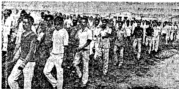
Volunteers of One of These Brigades in Bie Province

The Angolan people have firmly resolved to repulse South African aggression. In many regions of Angola, national guard brigades have been formed for the defense of the revolutionary achievements.