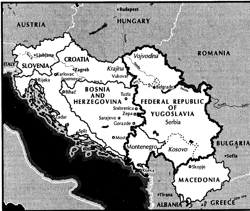
Figure 1. Map of Former Yugoslavia.

(UNPROFOR), the UN mission in Yugoslavia, as a force for peacekeeping.