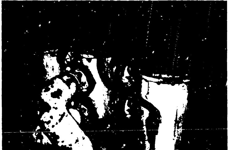
Figure 4: Oil in Bilge on Sealift Arabian Sea, December 11, 1993