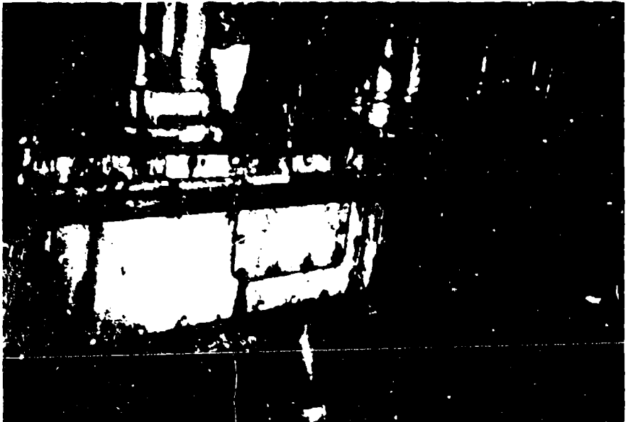
Figure 3: Oil Leak, Main Engine on Sealift Arabian Sea, December 11, 1993