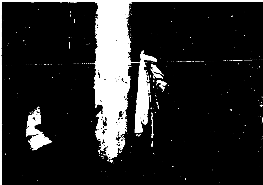
Figure 2: Sheet Used to Catch Oil Forced Out of Main Engine on Sealift Antarctic , October 15, 1993