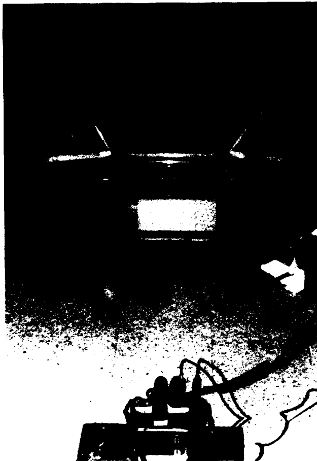
Fig. 1. Equipment for taking four-plane photographs of feet.

The foot was then marked with black ink at the center of the lateral and medial metatarsophalangeal joint, inferior medial aspect of the navicular, and inferior center aspect of the medial and lateral malleoli. The soft tissue arch height was marked using a polystyrene block with felt material glued on one edge to hold powdered chalk. The felt-covered edge was lightly placed against the medial aspect of the metatarsophalangeal joint, and the lower aspect of the block was held against the surface of the platform. Sliding the block along the arch area to the heel provided an indication of the soft tissue arch height. The photograph was then taken. One investigator (J.R.R.) marked all anatomic locations and took all photographs. Figure 3 is an example of one of the flattest 20% (based on methods used in Ref. 4), while Figure 4 shows one of the 20% highest arched feet.