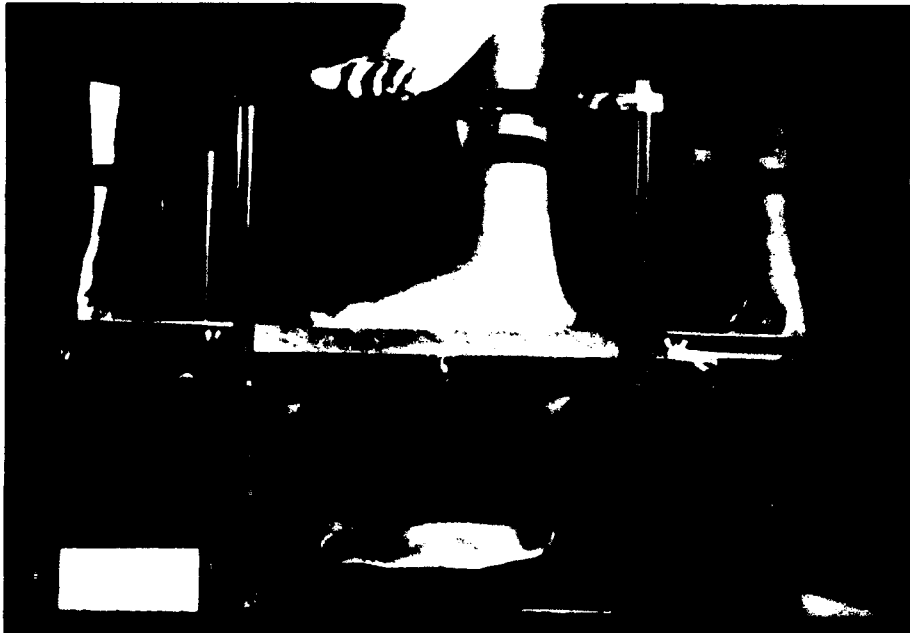
Fig. 3 Subject from the flattest quintile of study group.