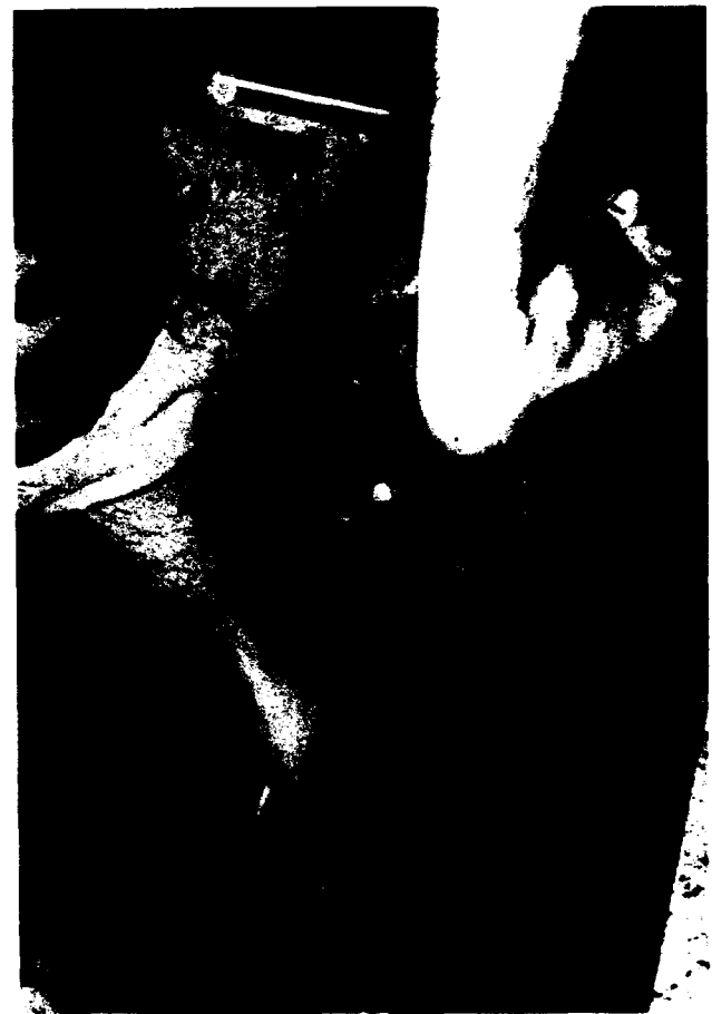
Fig. 2. View of subject standing on equipment.