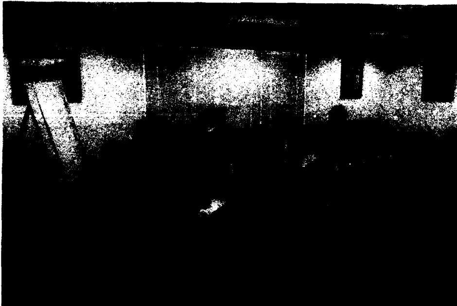
Figure 6. Workshop participants developing LRMP "issues" and "opportunities"

The final phase of the workshop was devoted to group work sessions. The attendees were divided into five work groups chaired by Legacy personnel and each group was tasked with identifying the most significant issues and opportunities facing the ERTA, LRMP, and DoD in general (Figure 6). The principal issues identified can be related to either command support, information management, training and education, or integrated resource management. For each of these general issues, there were a number of challenges. Many of the specific challenges listed below do not occur at every DoD installation. Some DoD installations have developed outstanding programs that offer solutions to some of the challenges listed. Also, there are a number of significant opportunities before DoD which, when taken, will provide substantial progress to the ultimate achievement of earth resources stewardship. The opportunities are categorized in terms of the principal issues. The issues and opportunities discussed in