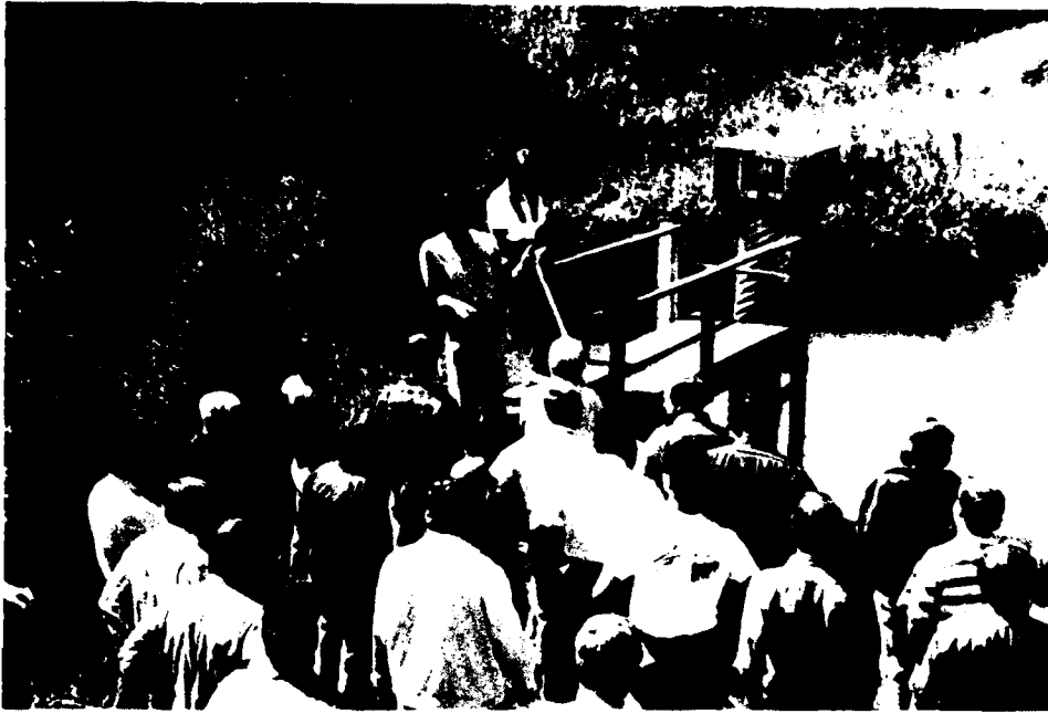
Figure 2. Field trip Stop 1 at State Road 85 crossing of Juniper Creek. Paul Albertson (WES) and Karin Fisher (RCE), center on platform, are explaining stream gage data collection and analysis