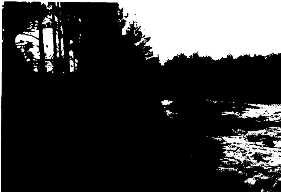
Figure 4. View of Stop 5, an active clay pit and a source of road construction materials

Stop 5 was at an active clay pit and one which is intended to be enlarged (Figure 4). Generally, most of the base is underlain by non-lithified Quaternary sands and gravelly sands. Clayey material is rather limited; however, such material is an important resource which is required for road surfacing and other applications. The occurrence of clayey material is usually limited to thin, near-surface weathered zones in the sands and gravelly sands. There are approximately 160 pits on the base which have been operated at one time or another as sources of clay or borrow material. These pits are subject to erosion by surface runoff and the closure of abandoned pits is an important environmental issue being addressed by resource managers. Furthermore, besides erosion, pit operation as well as pit closure must address the effects of mining or closure operations on floral and faunal habits and cultural sites at or near the pit. The enlargement and extension of clay pits involves considerations similar to the ones described for pit closure.