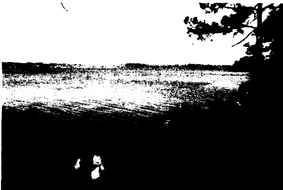
Figure 5. View of Stop 7, Rocky Bayou, a fringe wetland system and mouth of Rock Creek

The last stop of the field trip was Stop 7 at Fred Gannon State Park bordering on Rocky Bayou, an estuary inhabited by brown darters (Figure 5). Rocky Bayou is the mouth of Rocky Creek and it is an example of a fringe (marsh) wetland ecosystem. The management and protection of wetlands is another important resource management function at Eglin where, besides fringe wetlands, there are riparian, slope, and depressional wetland types.