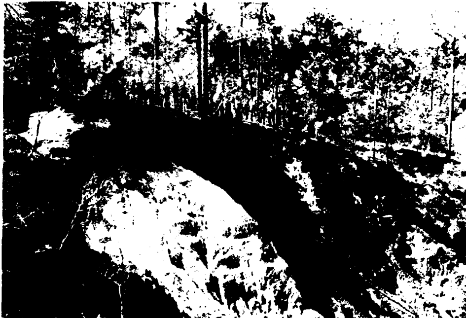
Figure 3. View of a steep head at Stop 3

habitats and they are the sources of a number of the darter streams. Groundwater seeps to the surface at the steep head providing water to the streams flowing away from the steep sandy face of these features.