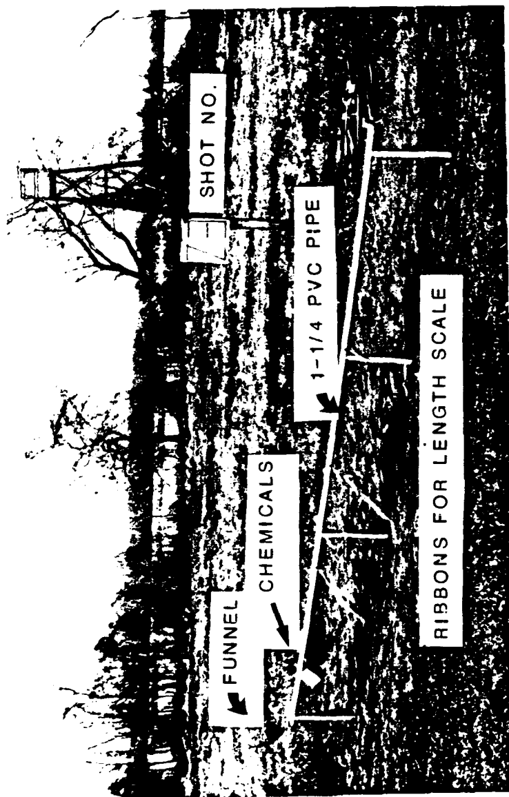
Figure 1. Pipe setup.