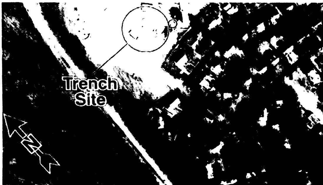
Figure 2. Interim product over Spring Valley site.

Until a photogrammetric model of the site could be developed, a number of initial graphic products were produced. This was done to provide a quick, historical, assessment of the site where the munitions were found and its surrounding area. These products were produced by TEC's Terrain Analysis Center for the Corps' Baltimore District that was operating on location at the Spring Valley site. The methods used for positioning of historical features on current map and photo products were accomplished through manual photo interpretation techniques (identification of features by tone, pattern, size, orientation and texture for example) and by rescaling disparate source materials. Figure 2 is an example of one of these products.