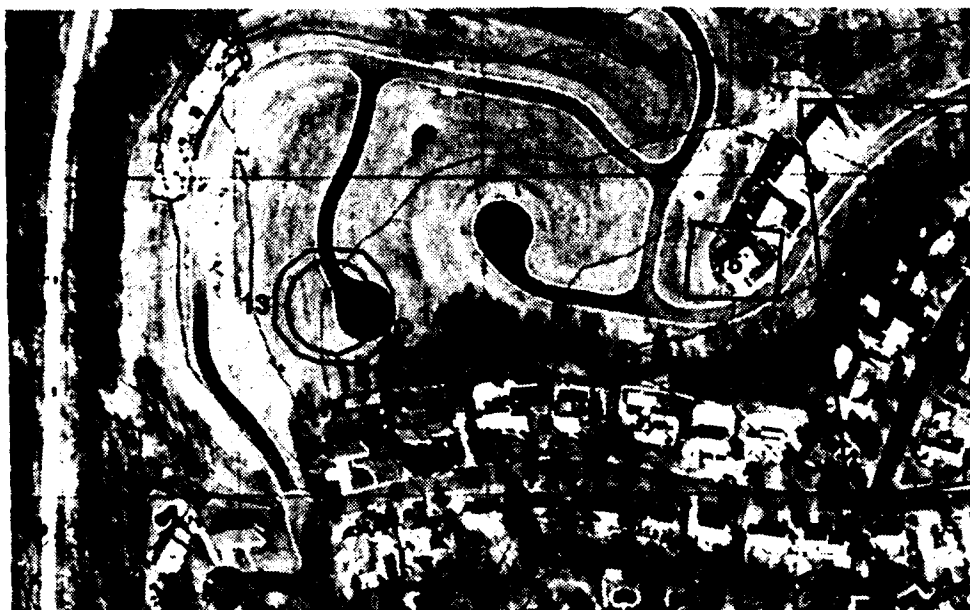
Figure 4. Portion of 1991 Orthophoto over Spring Valley.

The digital orthophotos were then exported to a Personal Computer (PC) where additional annotation was done to label the features, contours and grids, as well as insert a legend on the border. This PC also served as the digital interface to a large format high resolution plotter that was used to make the final output of the orthophotos. The plotter output the images at a resolution of 2,000 dots per inch. The scale of the output images was 1:2,652. An orthophoto for one of the 1993 images was also produced at the same scale. An example of the product is shown in Figure 4.