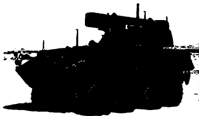
Figure 3. The HF antenna on the LAV/AD (front right of chassis) must be secured in the horizontal position when the LAV/AD moves.

The main cause of concern for LAV/AD critics is its weak communications capability. Voice communication will be possible via either HF radio or single channel ground-air radio system (SINGARS) VHF radio; however, the LAV/AD cannot talk HF while moving since it has to travel with its HF antenna in the horizontal position. (See figure 3.) While moving, the LAV/AD will be totally dependent on SINGARS for its cueing, control, and early warning. Until the planned installations of the interferometers and IRSTs becomes a reality, the gunners on the LAV/AD will have to rely mostly on their ability to visually identify targets before shooting them. The TV/FLIR system on the LAV/AD increases the operator's capabilities to identify bogies.