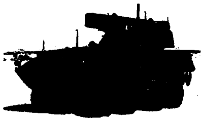
Figure 3. The HF antenna on the LAV/AD (front right of chassis) must be secured in the horizontal position when the LAV/AD moves.

The main cause of concern for LAV/AD critics is its weak communications capability. Voice communication will be possible via either HF radio or single channel ground-air radio system (SINCGARS) VHF radio; however, the LAV/AD cannot talk HF while moving since it has to travel with its HF antenna in the horizontal position. (See figure 3.) While moving, the LAV/AD will be totally dependent on SINCGARS for its cueing, control, and early warning. Until the planned installations of the interferometers and IRSTs becomes a reality, the gunners on the LAV/AD will have to rely mostly on their ability to visually identify targets before shooting them. The TV/FLIR system on the LAV/AD increases the operator's capabilities to identify bogies.