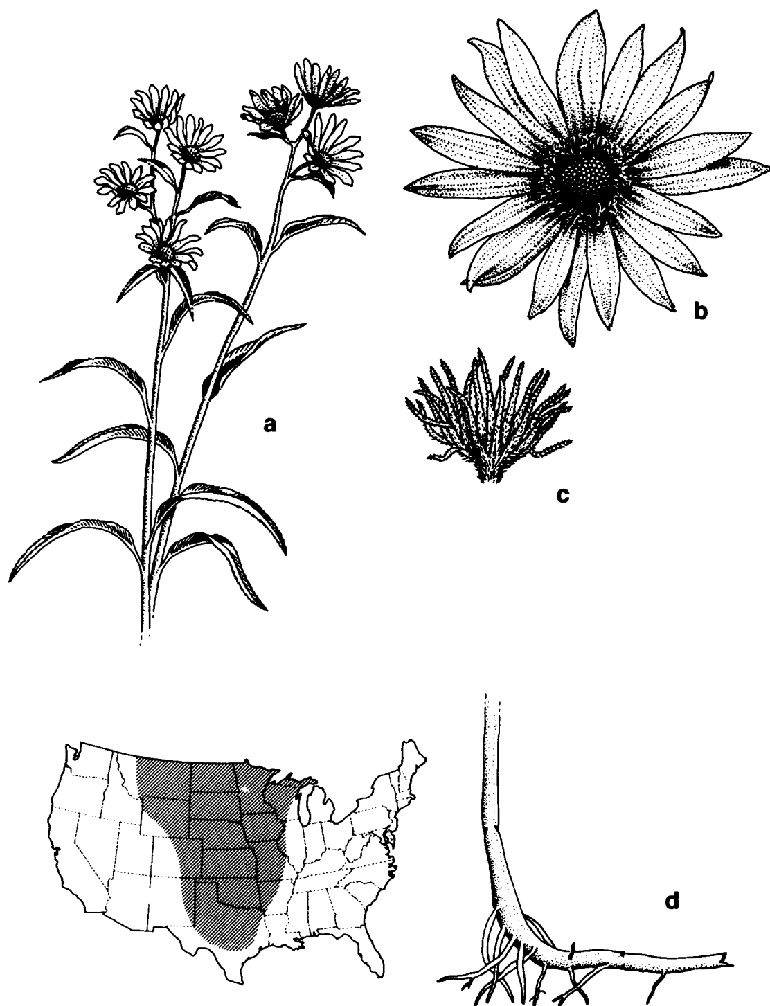
Figure 1. Distribution and distinguishing characteristics of Maximilian sunflower ( Helianthus maximiliani ): (a) typical growth form, showing stem and leaves, (b) composite head, (c) involucre bract, and (d) root