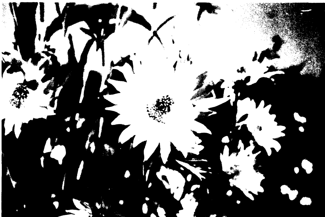
Figure 2. Vigorous stand of Maximilian sunflowers growing along a field edge in south-central Kansas

plantings should be established where mowing can be limited or delayed to permit seed maturity and completion of the nesting and brooding cycles of ground-nesting birds such as pheasants (Joselyn and Tate 1972).