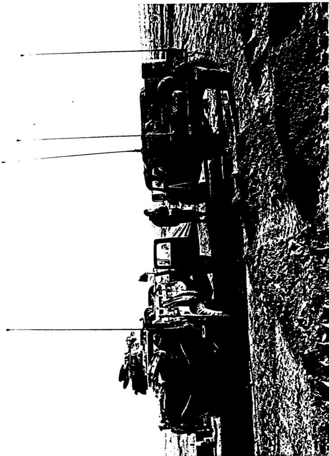
Figure 1. BDAT Assessment Operation, Iraq.